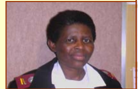
S.S MCHUNU - P.N.