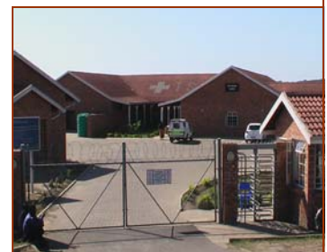
The picture of Isithebe Clinic