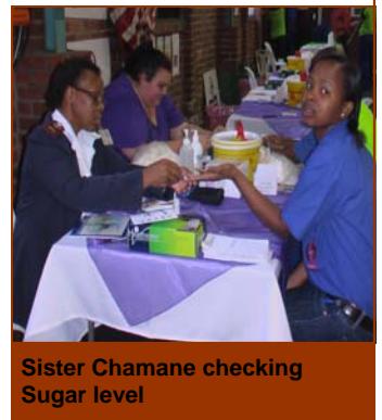
Sister Chamane checking Sugar level