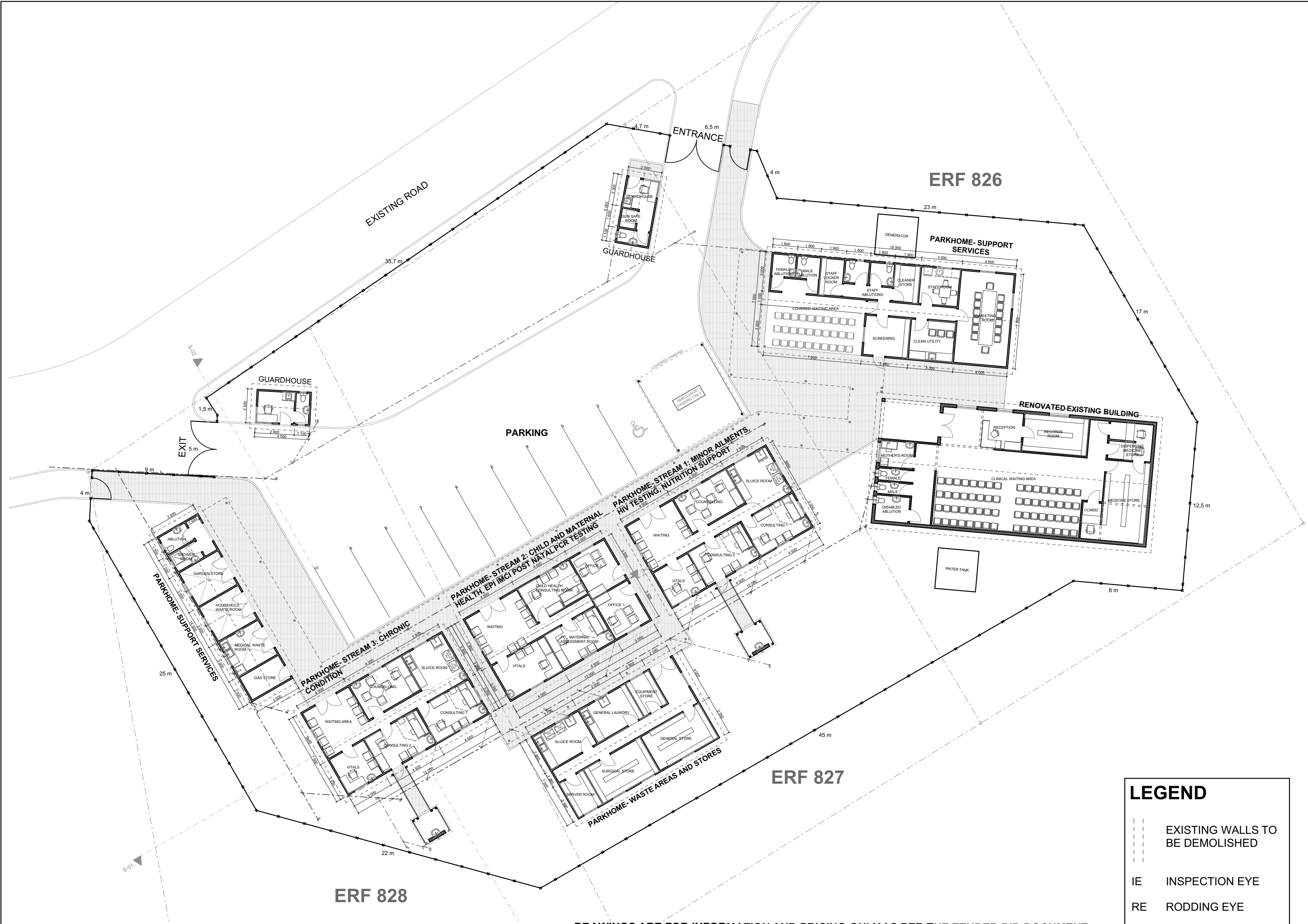
FLOOR PLAN SCALE 1:200