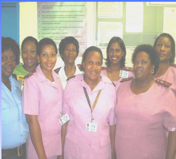
Hard working Staff from TCHC Maternity Ward

Tongaat CHC recently held a week long programme for STI (Sexually Transmitted Infections)/Pregnancy Awareness.