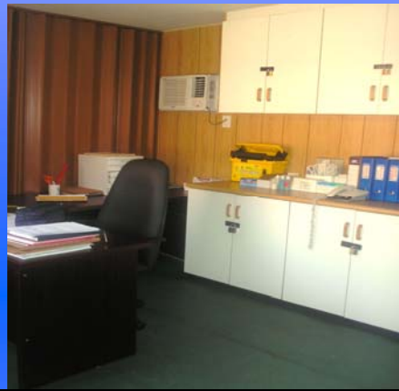
Above pics: exterior and interior of TCHC Occupational Health Clinic