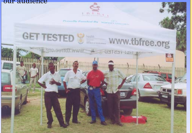
TCHC staff were quiet helpful on this big day