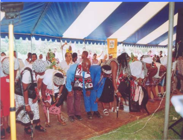
“Ngihawukel’ wethongo lami ngihawukele...” Cultural group/Izangoma were there too