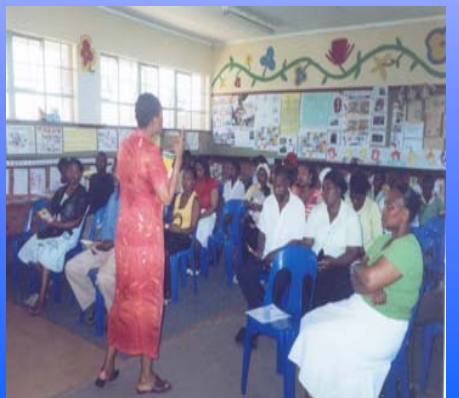
Children from Embonisweni Primary School in Tongaat, celebrating National School Health week, PARENTS OUGHT TO BE INVOLVED TOO!!