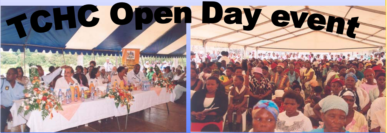
TCHC Management and Community Leaders

We take a sneak preview through the lens at the events that took place at Tongaat Community Health Centre