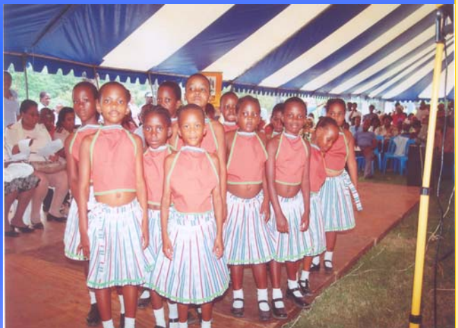
Local talent shone as these kids sang and danced for our audience