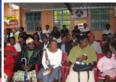
16 Days of Activism against women & children abuse