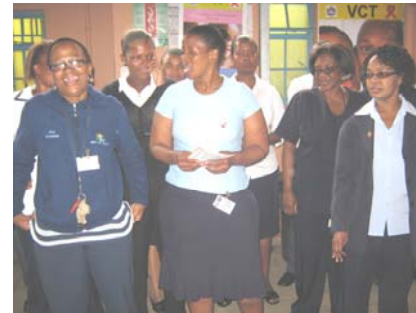
HAST AWARENESS DAY HELD IN DECEMBER 2009