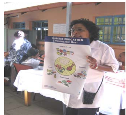
DIABETES AWARENESS & SUPPORT GROUP IN NOVEMBER 2009