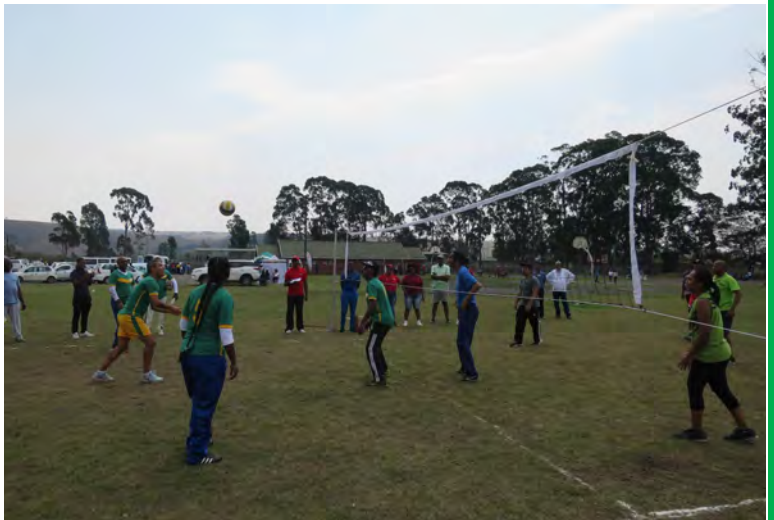
Volley ball team preparing for provincial tournament