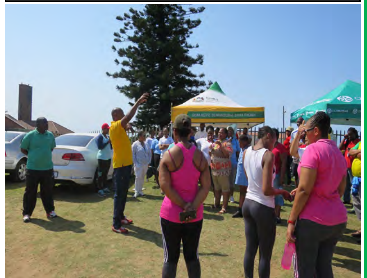
Employees taking instructions for 5km walk