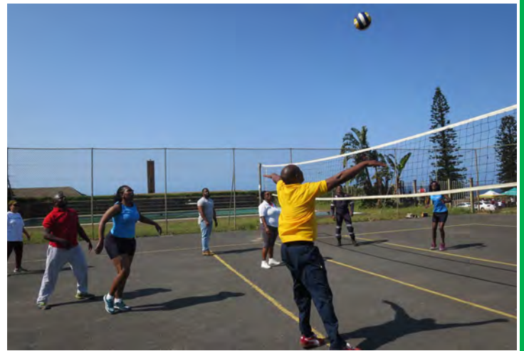
District office volley ball team