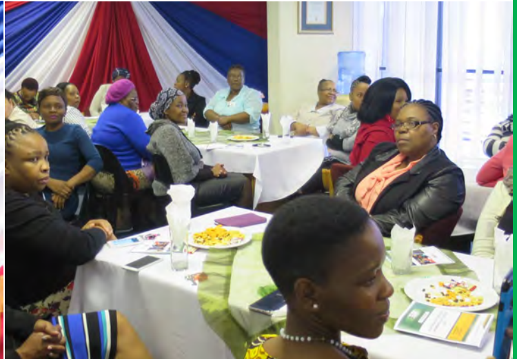
Ugu Health District office ladies on their special day listening to a motivational speaker