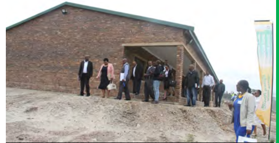
Isikhungo i-Khanyisizwe kwaXolo