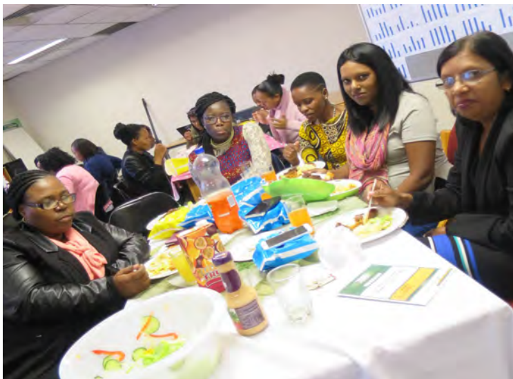
Ugu Health District office ladies enjoying food prepared by men