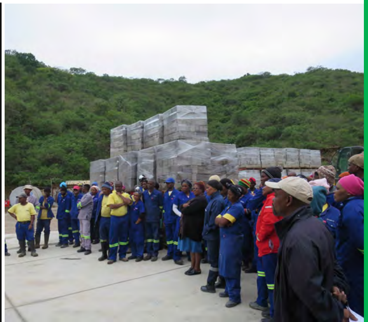
NPC employees during TB health education

The local industry management which already visited appreciates the service. Health of their employees is also their concern