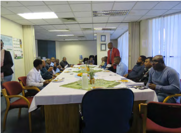
Guests for the day dealing with their issues