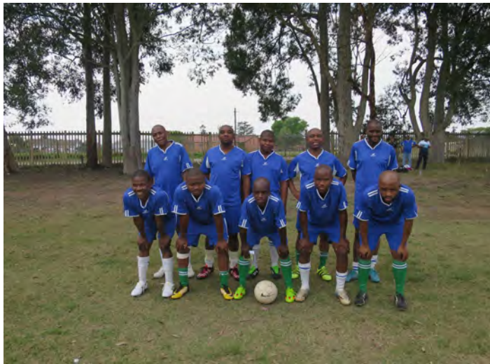
Murchison hospital soccer team during sport day