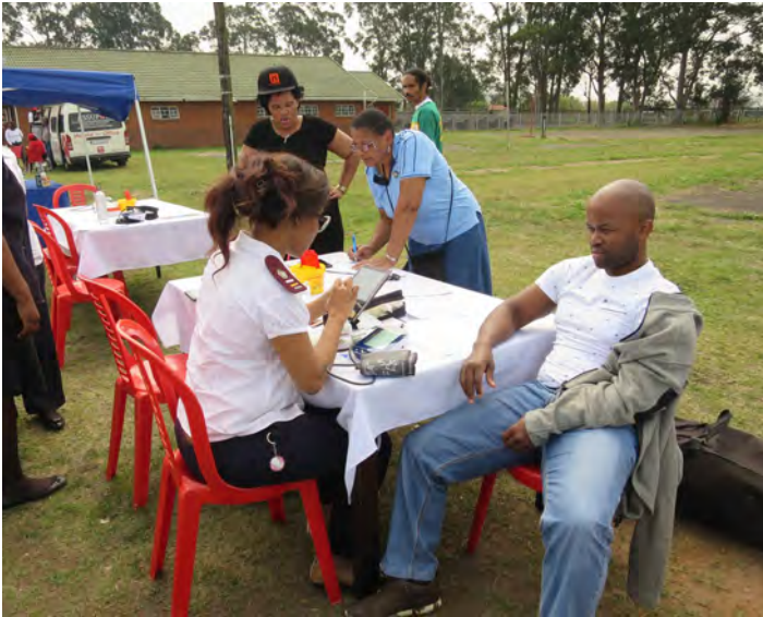
Nursing staff giving health services during sport day