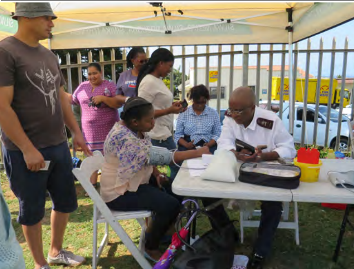
Health services by GEMS