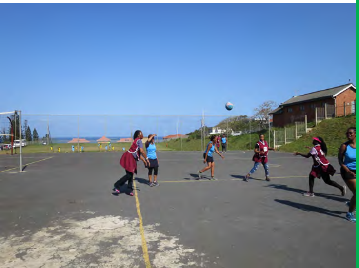
District office netball team