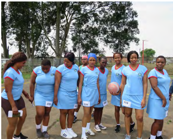
Turton ChC netball team during sport day

On the 22nd September 2017 Ugu Health District hosted sports and wellness event at Harding sport ground, where Ugu Health facilities gathered for work and play initiative which is promoted by the provincial office. Staff members were playing different codes of sports and this is in preparation of the provincial tournament which is organized every year.