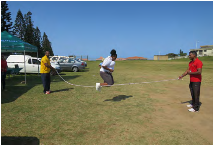
Skipping rope during wellness day