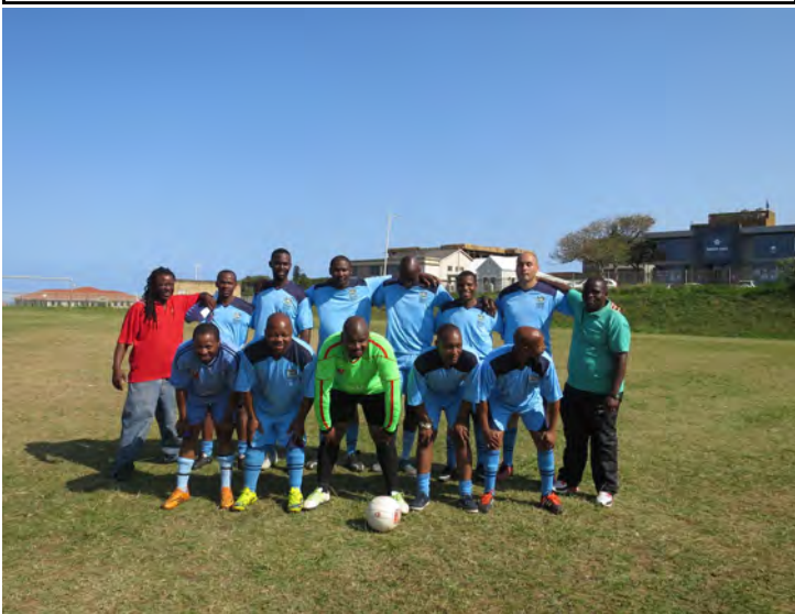
Soccer team preparing for the District sports day