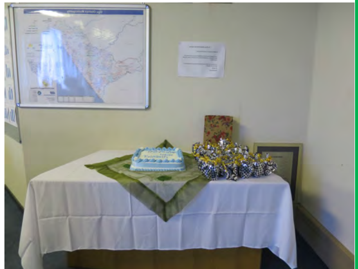
Gifts for men on their special day

Ugu Health District Office ladies organized men's event in a month dedicated for men. In July, the focus is on men, Department of Health focus the most on health issues. On the 21st July 2017 Ugu had a well planned event for men where they celebrated their month and got time to speak about their personal and also work related issues.