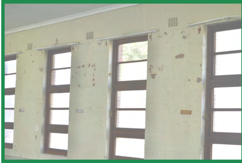
The wall before it was painted