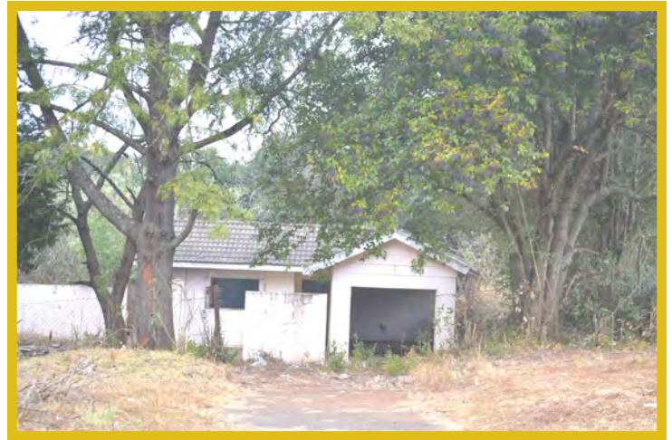
The house after the trees were trimmed