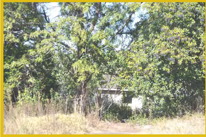
The unused house before the trees were trimmed