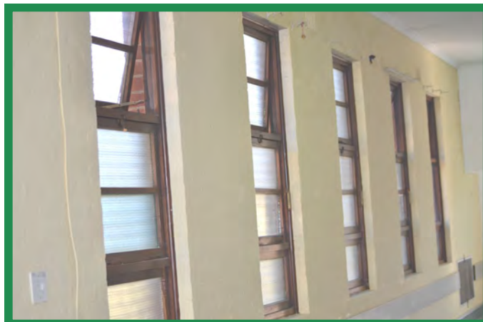
The ward after painting