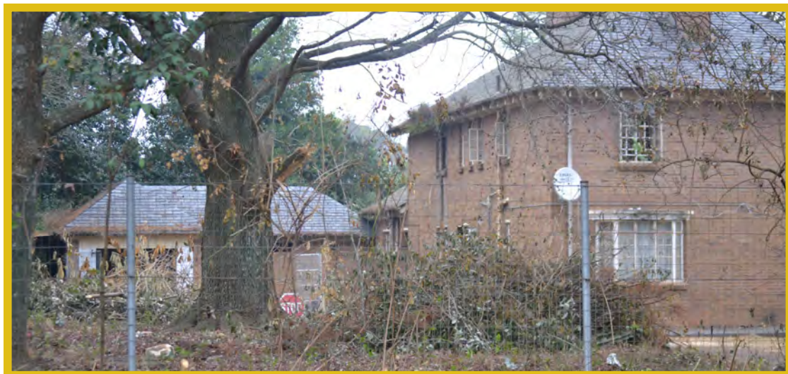
Staff residence after the parameter fence was cleared