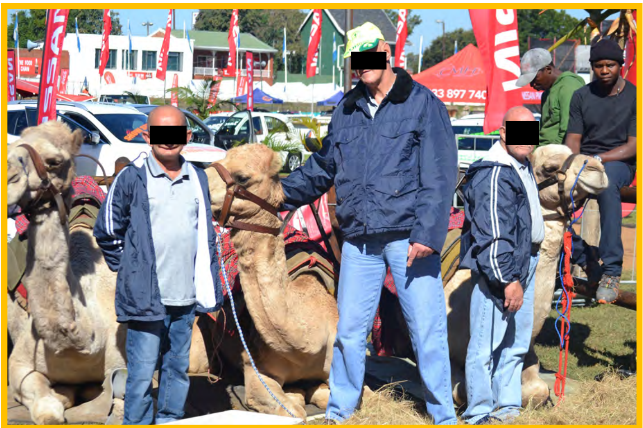
MHCUs at the Royal Show

The Friends of Umgeni (FoU) has always been instrumental in ensuring that twenty MHCUs are funded to attend the Royal Agricultural Show and have pocket money for spending. The Management would like to thank the FoU for their continuous support in orientating MHCUs with the outside world through their generous offerings and resources.