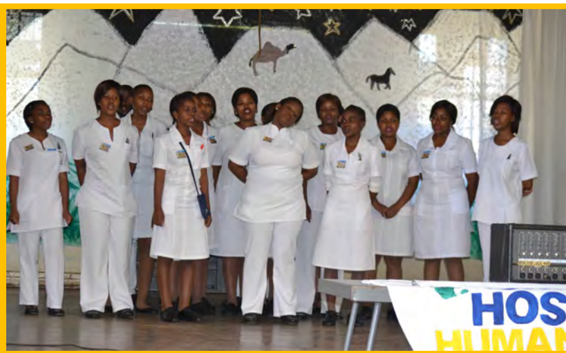
Durban University of Technology Student Nurses Choir