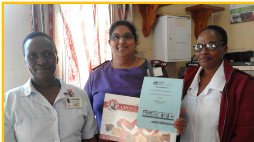
Best Ward Participation: Ward D1