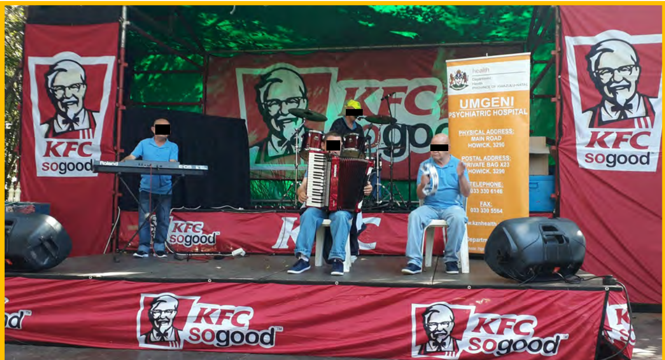
Umgeni Hospital Band Playing at the Royal Show River Stage