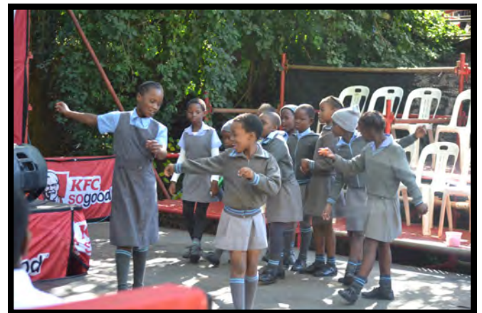
Scholars enjoying the music