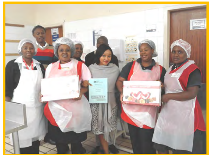
Best Section Participation : Food Services