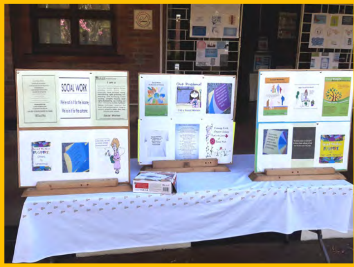
Pamphlets on display