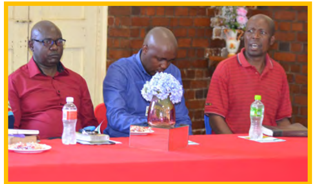
Abashumayeli bamazwi ayisikhombisa ashiwo indodana kaNkulunkulu ilenga esiphambanweni