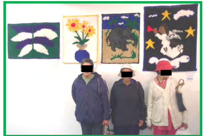
MHCU's with their items on display at the Royal Show