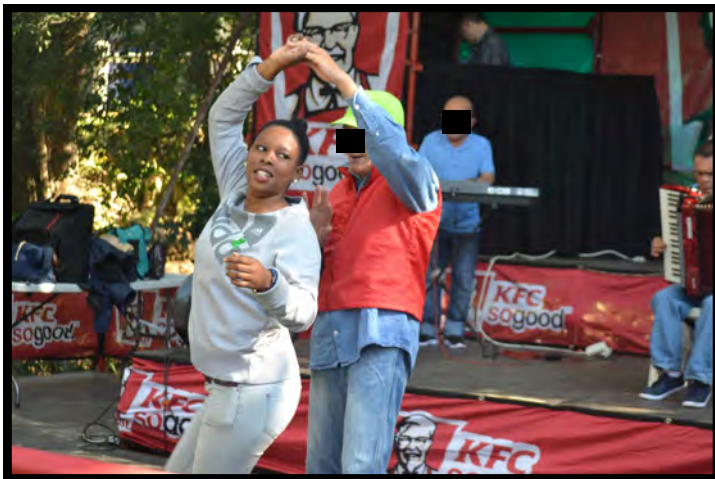
MHCU dancing with staff member