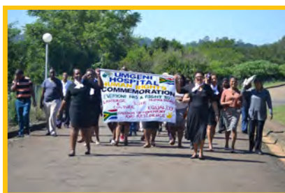
Human Rights Day READ MORE ON PAGE 3