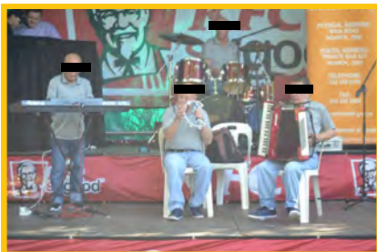
Royal Show READ MORE ON PAGE 1