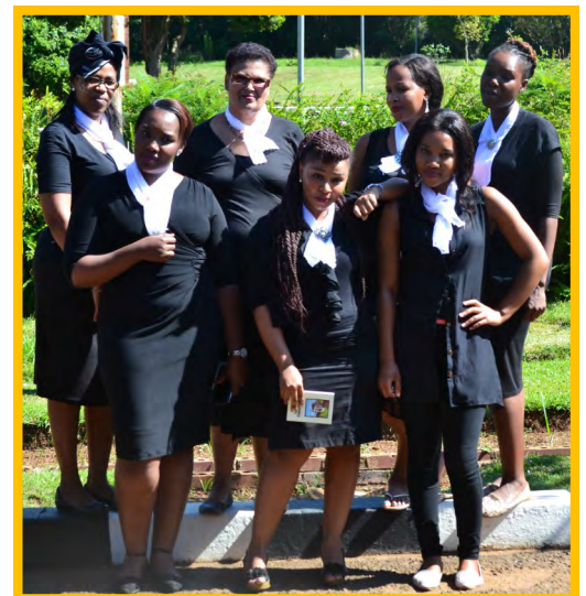
Special Events Committee Members