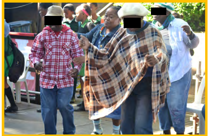
MHCU's dancing at the River Stage