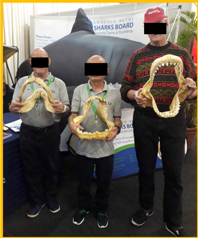
Band Members during shark dissection