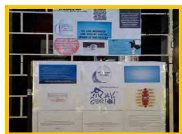
Social Workers Day READ MORE ON PAGE 5