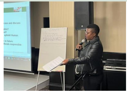
Human Rights workshop at Premier's Hotel

n 3-4 March 2022, Umkhanyakude Health District held its Human Rights Workshop with staff members from all its five (5) district hospitals and one (1) Community Health Centre. The purpose of the workshop was to sensitize health workers about human rights that may be violated (aware/ unaware) while they render health care services. Among key topics covered during the workshop were: Batho Pele Principles, Bill of Rights, Health Act, Gender Based Violence, Caring for Key Population Groups and many others. Such activities are crucial in improving the manner in which healthcare services are rendered to all citizens irrespective of their economic status, sexual orientation, age, race, religious belief or any other difference that particular patient may have with healthcare provider.