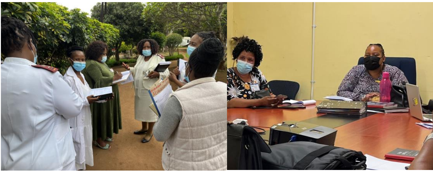
Assessment at Mosvold Hospital