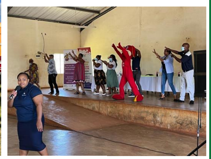
She Conquers Dialogue at Phumlani Hall, Hluhluwe

s part of responding to unpleasant high numbers of teenage pregnancy, Umkhanyakude Health District, Civil Society, Municipalities, NGOs and many other community stakeholders held It is believed that every girl should a dialogue on 25th February 2022 at Hluhluwe under the banner of "She Conquers".