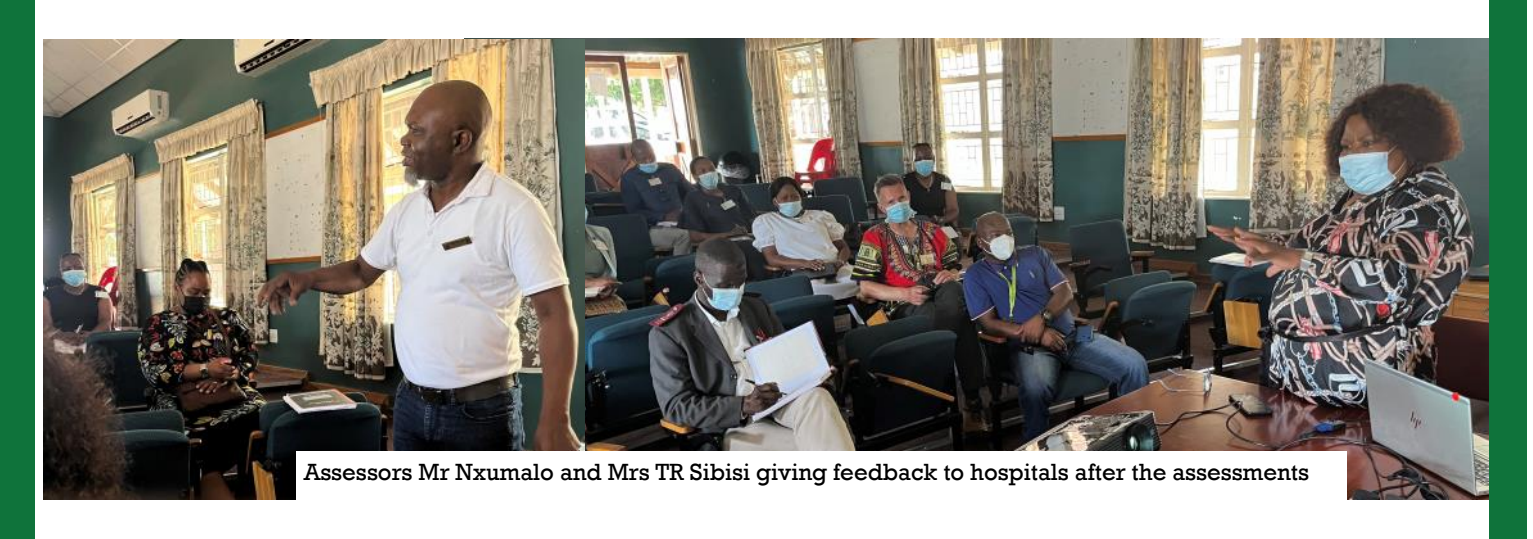
Assessment at Hlabisa Hospital

hree (3) hospitals viz Hlabisa, Bethesda, Mosvold and one community health centre viz Othobothini were assessed in December 2021 on Khaedu project. The word "Khaedu" in Tshi-Venda means "Challenge". Through this programme, health service delivery especially in client's perspective was assessed to ascertain challenges hindering service delivery. In areas where facilities