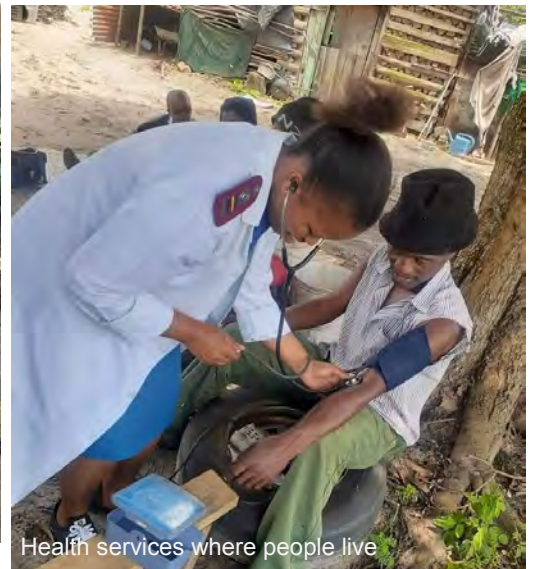
Health services where people live