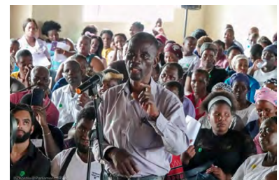
NHI Public Hearing READ MORE ON PAGE 07