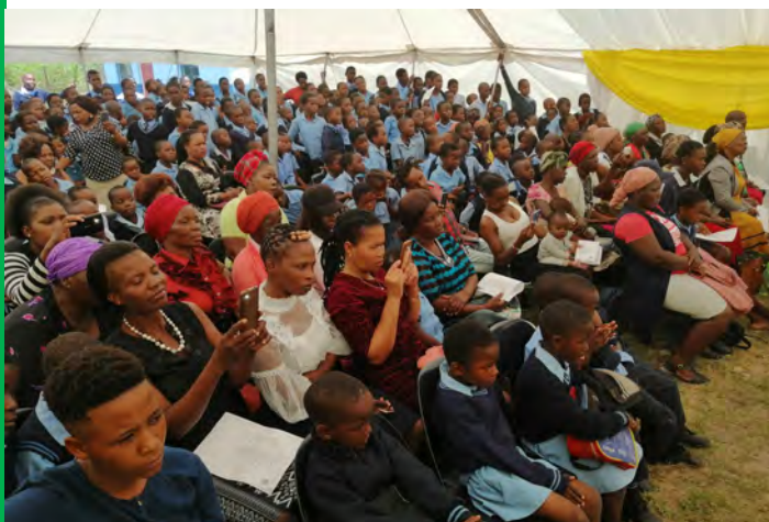
Pupils with parents during celebration