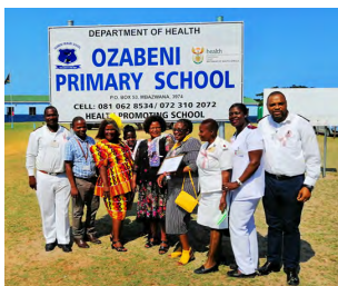
Health Promoting School Status READ MORE ON PAGE 4