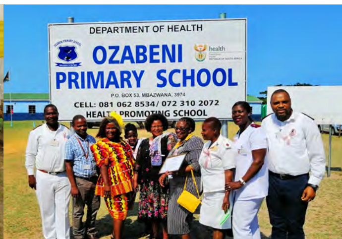
Unveiling of the health promoting school board