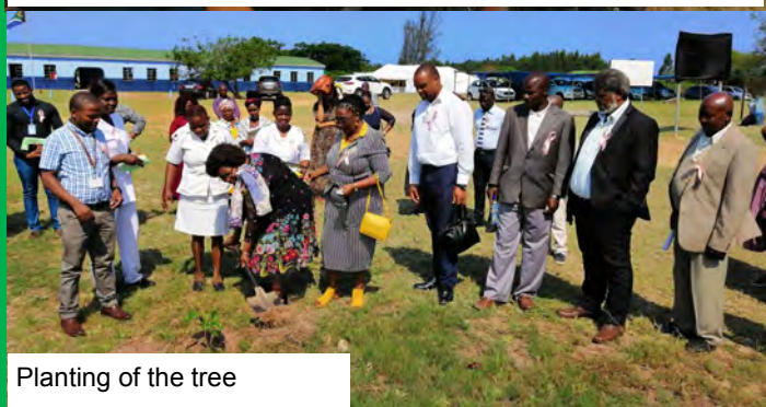
Planting of the tree