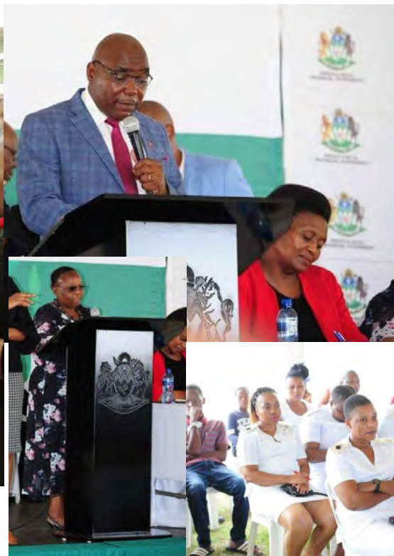
Left: Umkhanyakude District Mayor Cllr Solomon Mkhombo making remarks.