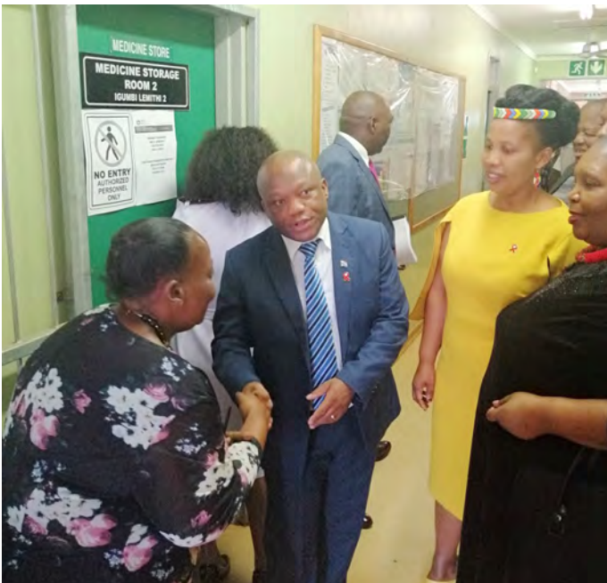
Top: Premier Sihle Zikalala, MEC Hlengiwe Mavimbela, Umkhanyakude Deputy Mayor Cllr Fikile Hlabisa expressing gratitude relating to the functionality of Hlabisa Gateway Clinic.

The 90-90-90 concept was introduced to set goals that 90% of HIV infected people should know their status; 90% of those who know their status should be initiated on anti-retroviral therapy and 90% of those on treatment should be virally suppressed. All this should be achieved by 2020.