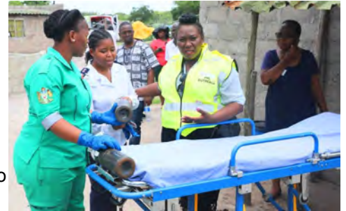
Some patients were referred to clinics

which will take place once a month in various districts - is therefore to improve health outcomes in the Province, by focusing on preventative, promotive, curative and rehabilitative healthcare in an integrated, comprehensive and effective way.