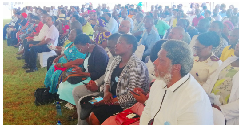
People of Umkhanyakude came in numbers to attend 90% 90% 90% achievement celebration