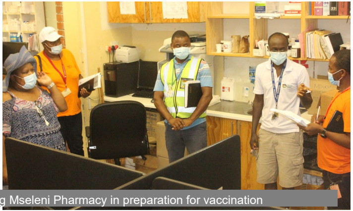
Health teams inspecting Mseleni Pharmacy in preparation for vaccination

U mkhanyakude Health District conducted Covid-19 vaccination readiness assessments in all its facilities during the 4 th quarter of 2020/21 financial year. This was a very crucial activity to establish challenges earlier so that they may be addressed.