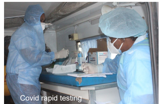
Covid rapid testing

This activity was very important due to widespread misinformation about vaccines which are likely to create resistance when the time comes for community members to be vaccinated.