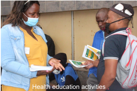
Health education activities