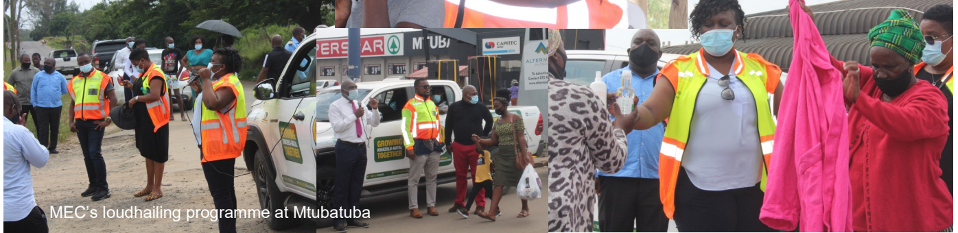
MEC's loudhailing programme at Mtubatuba