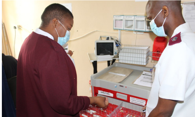
Emergency trolley being audited at Mosvold Hospital

U mkhanyakude Health District conducted Covid-19 vaccination readiness assessments in all its facilities during the 4 th quarter of 2020/21 financial year. This was a very crucial activity to establish challenges earlier so that they may be addressed.