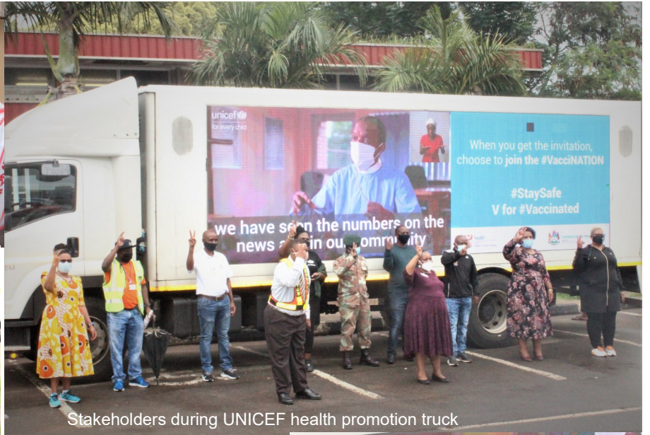
Stakeholders during UNICEF health promotion truck