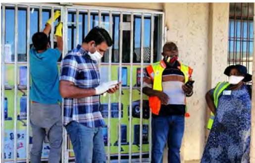
Umkhanyakude Mayor Cllr T.S. Mkhombo enforcing compliance to regulations

Umkhanyakude District Mayor Cllr Solomon Mkhombo and UMhlabuyalingana Local Municipality Mayor Cllr Nkululeko Mthethwa led a massive Covid-19 regulations enforcement campaign in Manguzi and Mbazwana towns on Monday 4th May 2019.