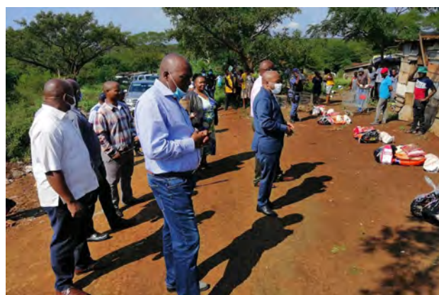
KZN Premier Mr Sihle Zikalala and Umkhanyakude District Mayor Cllr T.S. Mkhombo handing over gifts to impoverished community in Hluhluwe Tin Town informal settlement

K ZN Premier Sihle Zikalala supported by Umkhanyakude District Mayor Cllr Solomon Mkhombo delivered food parcels to the needy in the Umkhanyakude District in Hluhluwe as well as Mtubatuba on 14th April 2020. The Premier, who is the Operation Sukuma Sakhe Champion of the district assessed the situation in the district and whether people are compliant with the lockdown regulations. The parcels were delivered at the Emakopini informal settlement in Ward 5, Hluhluwe under Big 5 Hlabisa LM as well as in Mfekayi in Ward 10 under Mtubatuba LM. Premier further conducted health education and awareness on COVID-19 encouraging community to maintain highest hygienic standards, social distancing, and observe lockdown regulations.