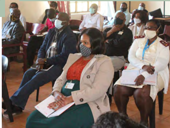
Umkhanyakude Health District Management Team

M embers of KwaZulu-Natal Natal Legislature visited UMkhanyakude Hospitals and clinics from 24-26 June 2020. The purpose of the visit was to assess and establish the state of readiness as far as Covid-19 is concerned; this is part of their oversight work that they conduct on government departments to ensure that service delivery commitments made by MECs are adhered to.