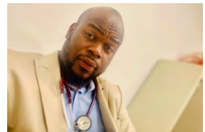
Young professionals reflections on Youth month READ MORE ON PAGE 04