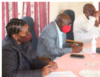
Legislature visited Umkhanyakude Health facilities READ MORE ON PAGE 3