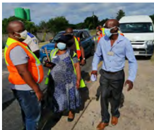
Mayor's compliance programme READ MORE ON PAGE 2