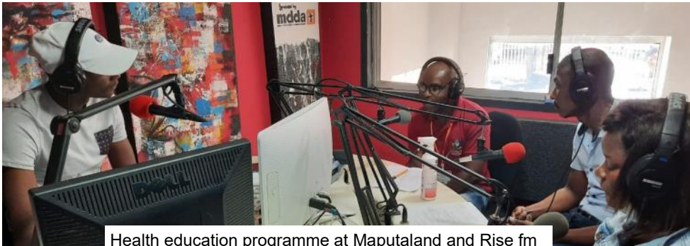
Health education programme at Maputland and Rise fm

Umkhanyakude Health District has embarked on health promotion and demand creation drive for Covid-19 vaccination programme.