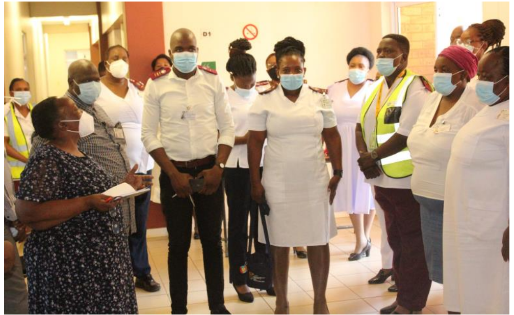
District Director commending health workers for dedication in Hlabisa vaccination site