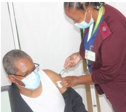
MPL Hon. V.F. Hlabisa getting Vaccinated at Inkosi Mzondeni Hall vaccination site