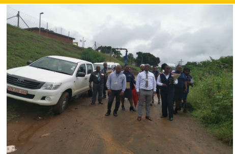
NQO-NQO-NQO SIKHULEKILE... READ MORE ON PAGE 04