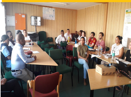
INDUCTION & ORIENTATION... READ MORE ON PAGE 03