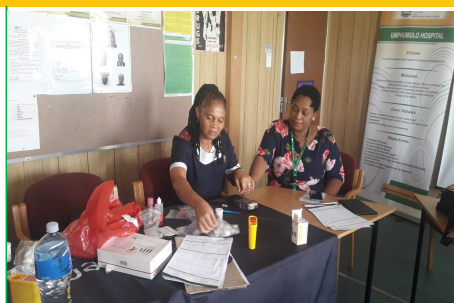
HEALTH SCREENING... READ MORE ON PAGE 06