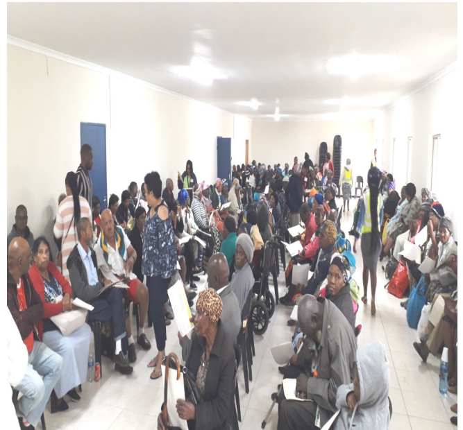
Screening of clients before they went for eye operation