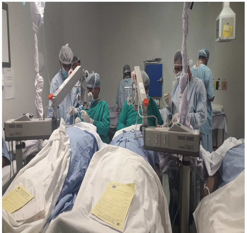
Eye Surgeons and Medical Technicians operating clients

Prior the camp clients were first screened in order to assess their readiness before they went for surgery. It was indeed a very difficult moment for the team as they had to explain to other clients who were so keen to be removed cataract but were not ready by then according to the screening process due to other minor health problems.