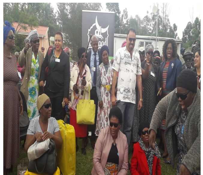
Happy clients after successful cataract removal