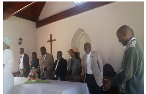
PRAYER DAY... READ MORE ON PAGE 4