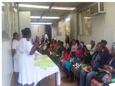
GATEWAY CLINIC EVENT READ MORE ON PAGE 3