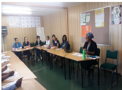
INDUCTION & ORIENTATION..... READ MORE ON PAGE 2

In closing I would like to take this opportunity to thank each and everyone of you for your endless efforts in ensuring that our patients are given the expected kind of service they deserve. I believe that if we continue working as a team, a lot could be achieved and also portraying a positive staff attitude and practicing Batho Pele principles at all times will help our clients to gain back the strength. .... THANK YOU !!!