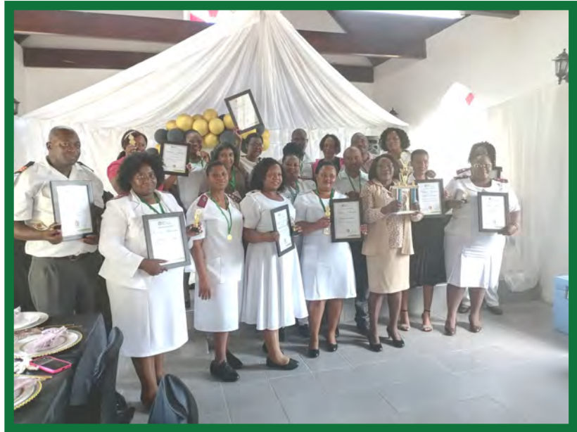
UMPHUMULO GATEWAY STAFF AFTER RECEIVING THEIR AWARDS

It was indeed a joyful day for Umphumulo Gateway Clinic staff as they celebrated their achievement for Ideal Clinic Status. Gateway Clinic has done us proud in the past four (4) financial years as they have achieved only Platinum Status during Ideal Clinic Peer Review Assessments which are conducted yearly.