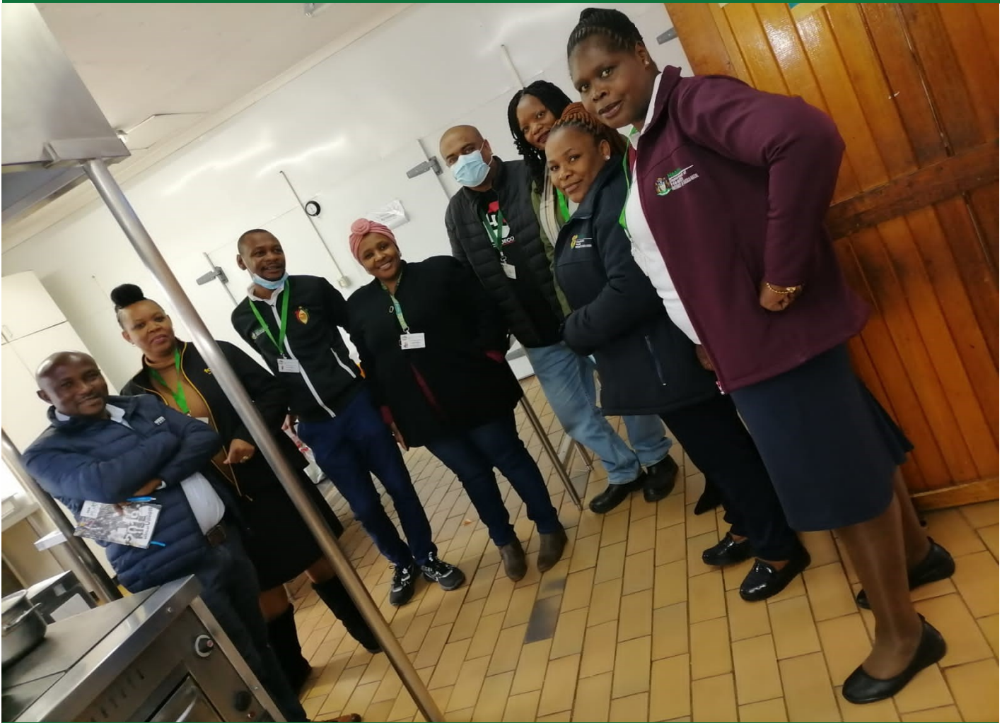
Part of the Health and Safety Committee Members during an unannounced inspection

The safety of employees is considered as a number one priority in each and every organization. It is the employer's responsibility to ensure there is a safe and conducive work environment for all employees.