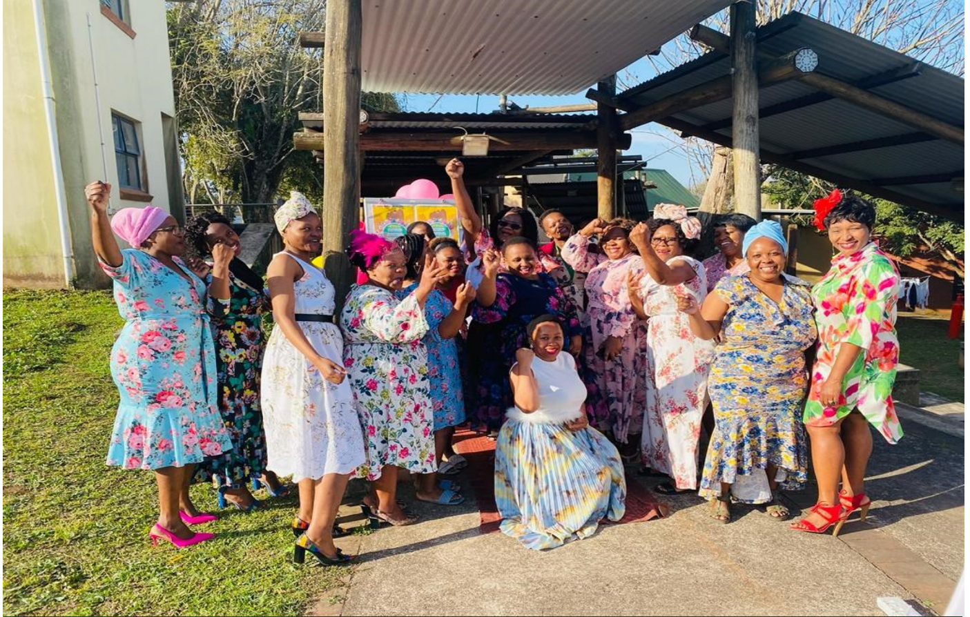
Abasebenzi bethokozile ngosuku lwabo olukhulu lokugubha inyanga yabantu besifazane