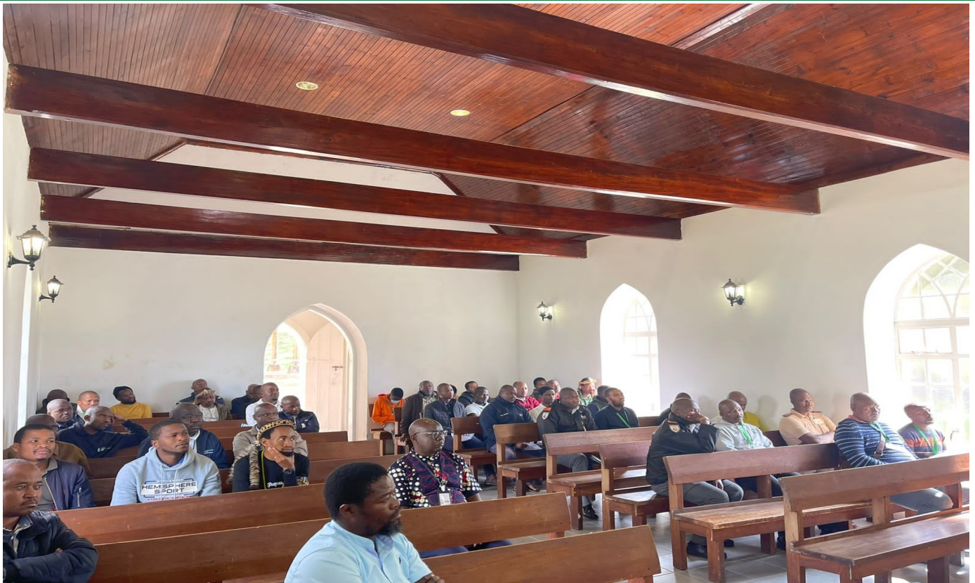
Umpfumulo male employees from the hospital and clinics gathered in the hospital chapel