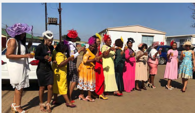
The ladies were dressed up and you could tell they were ready to walk on the red carpet. Excitement of looking good was encouraging them to take photos with different postures.