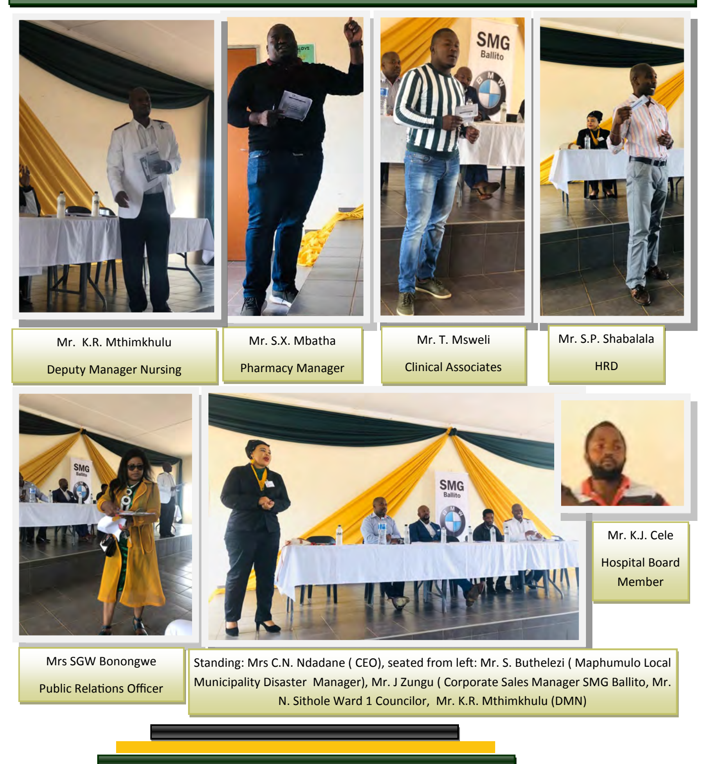
My health, your health, A healthy KwaZulu-Natal