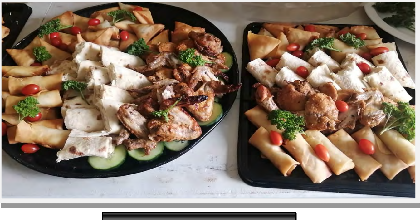
My health, your health, A healthy KwaZulu-Natal