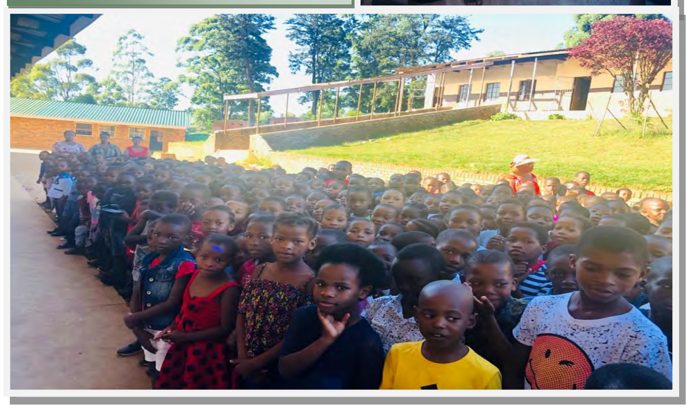
My health, your health, A healthy KwaZulu-Natal