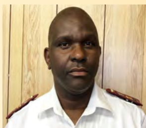
Sir GTD Mthethwa Monitoring & Evaluation