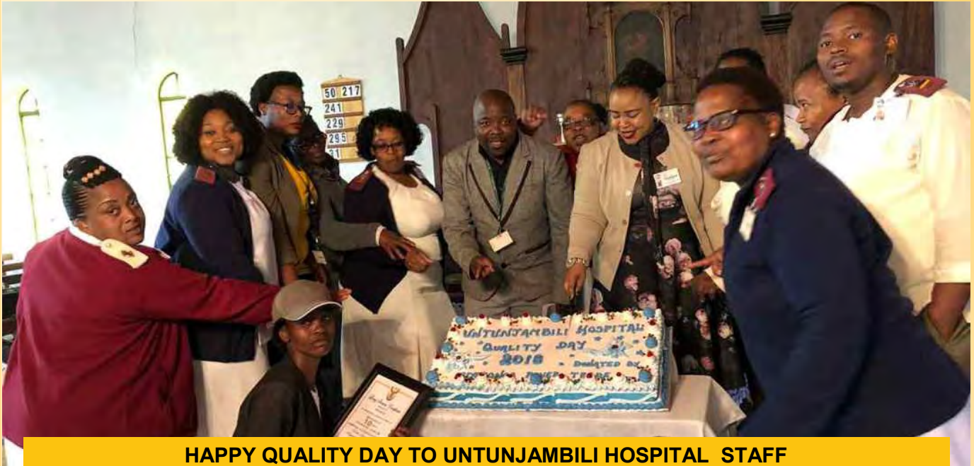
HAPPY QUALITY DAY TO UNTUNJAMBILI HOSPITAL STAFF CUTTING OF THE CAKE