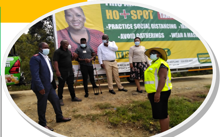
UNTUNJAMBILI ROAD SEMINARY TO RINGINI AREA