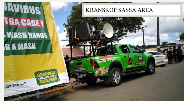
KRANSKOP SASSA AREA