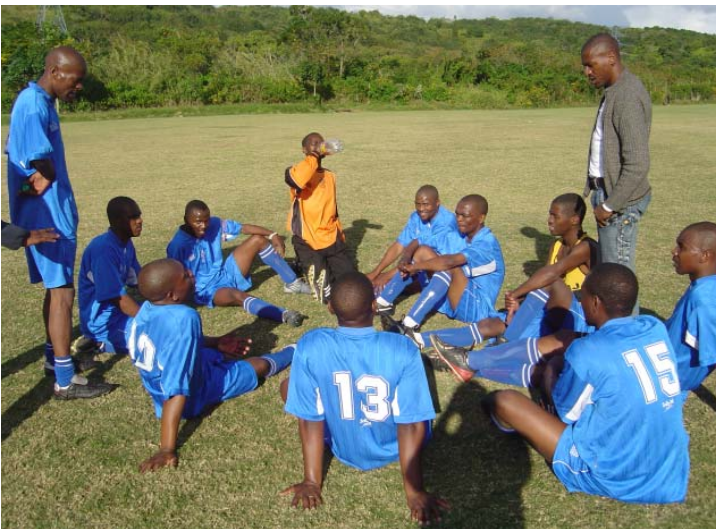
Soccer Team at IALCH sports grounds