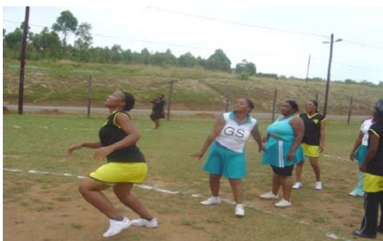
tunjambili Primary Team