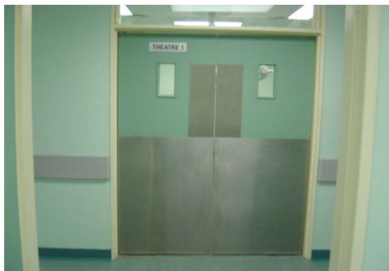
NEW OPERATING THEATRE AFTER