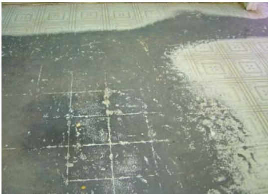
VCT FLOORS BEFORE