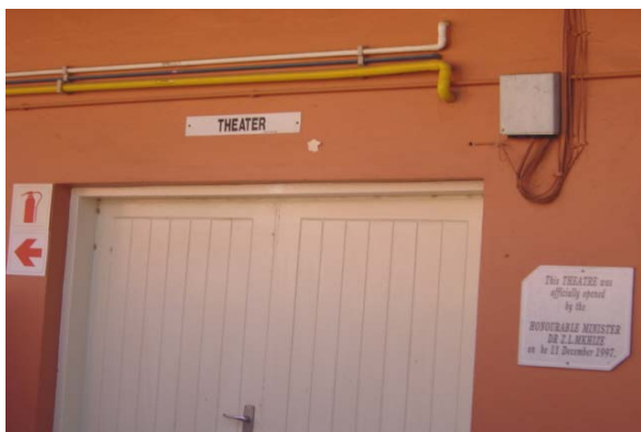
OPERATING THEATRE BEFORE