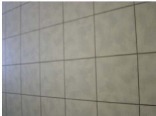
VCT FLOORS AFTER