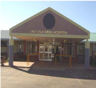
Untunjambili District Hospital