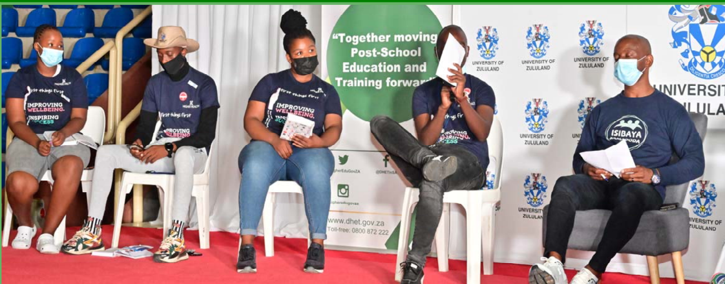
Below: Participants panel during the engagement session where robust ideas were shared