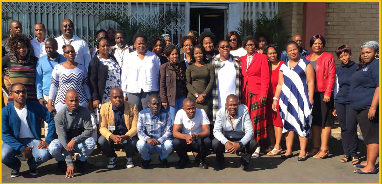
Above Picture: King Cetshwayo Health District MMC team from different facilities