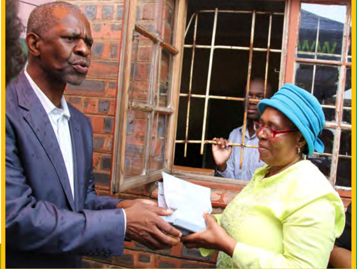
MEC issued medication to one of the CCMDD beneficiaries at Esikhaleni Crèche Pick Up Point.