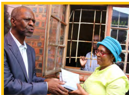
CCMDD Roll-Out 2017 READ MORE ON PAGE 07-08