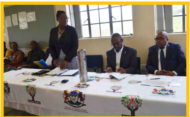
Above Photos: This is during the briefing session at UMbonambi clinic outlining the programme of the day.