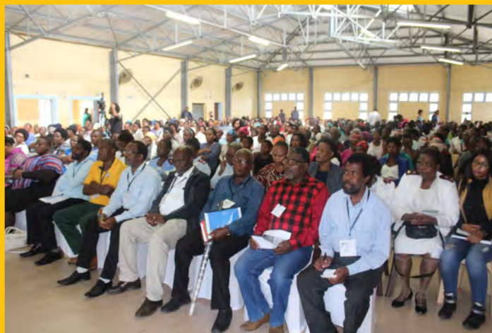
Above: Community listened attentively to all the speeches of the day during the CCMDD