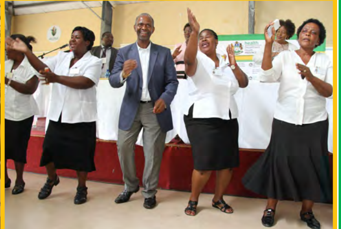
MEC with Community Care Givers entertaining the audience during the CCMDD roll-out.