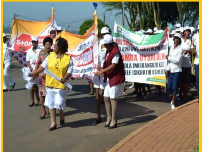
Above Picture: King Cetshwayo Health District Staff and Ngwelezane Clinic took it to the street of Ngwelezane to Commemorated World TB Day on the 31 st of March 2017 at Ngwelezane Clinic Ward 28