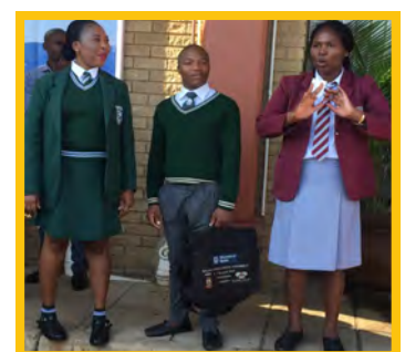
Youth Day 2017 READ MORE ON PAGE 10