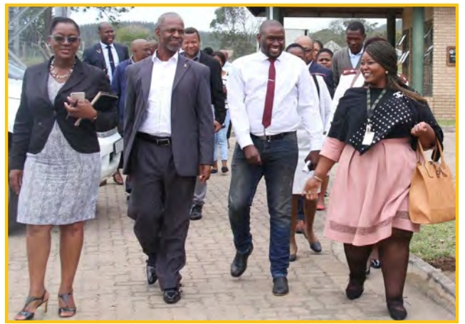
Above Photos: Tree planting during Cabinet OSS visit to King Cetshwayo District Municipality where different uMfolozi Municipality wards were visited.

P rovincial Government visited King Cetshwayo District under the banner of Cabinet Operation Sukuma Sakhe, which was hosted by uMfolozi Municipality on the 30th of August 2017. Eleven wards of uMfolozi Local Municipality were visited by different MECs. The purpose of the visit was to assess the progress made by different government services on different levels of service delivery. This assisted the leadership to better understand the community needs during community engagement and debates.