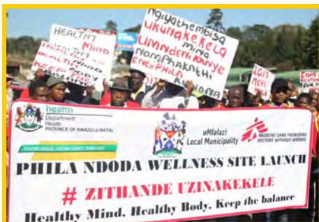
Philandoda clinic launch READ MORE ON PAGE 03-04