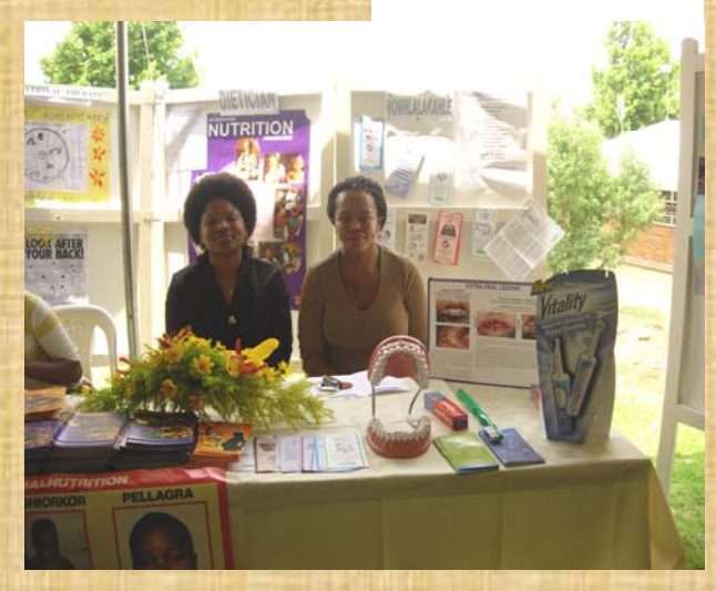
DENTIST AND DENTAL ASSISTANST IN THEIR STALL SHOW CASING THEIR WORK.