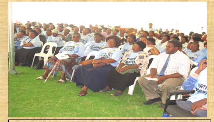
ABOVE WAS ENTERTAJNMENT FROM THE HOSPJTAL CHOJR, ABAFANA BENDLAMU AND THE COMMUNITY WHO CAME IN NUMBERS