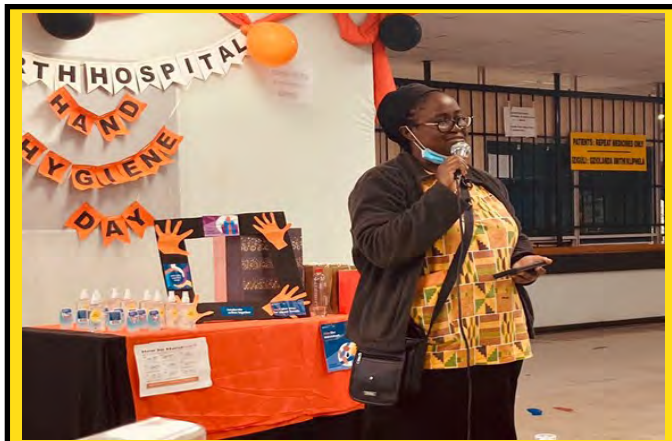
MOPD Clinical Manager during the Hand Hygiene Day