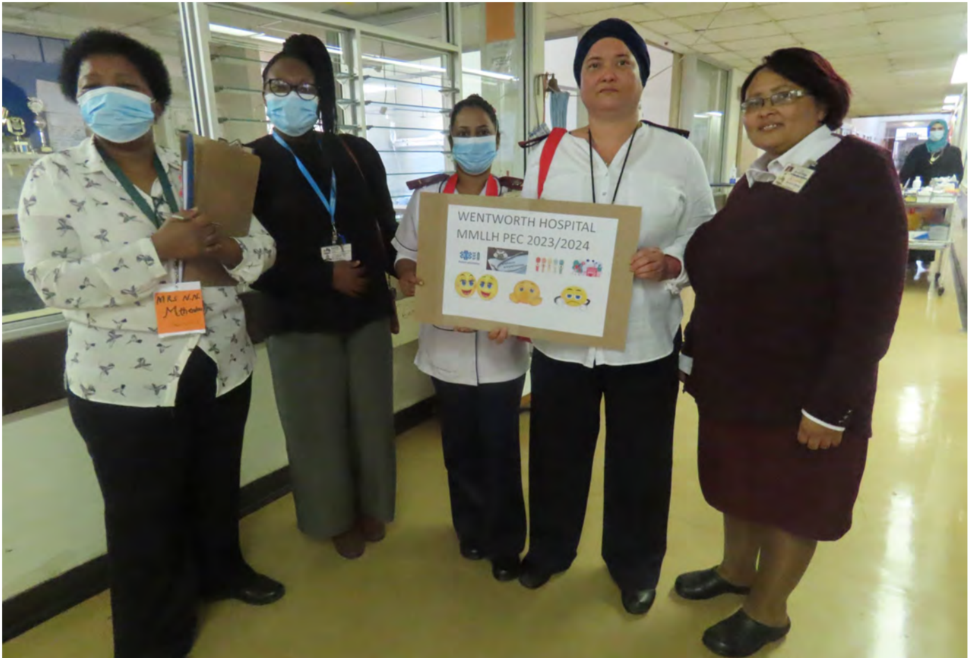
Monitoring and evaluation team during the survey

On 18 July 2023, Wentworth Hospital was visited by Clairwood hospital team to conduct the Patient Experience of care survey better known as the “PEC Survey”. This survey was done in preparation for the annual PEC survey scheduled to take place during the month of August. The patient experience of care survey assists the facility to get a picture of the type of experience that patients have when they visit the facility. The Patient experience of care survey covers the following elements:- Waiting time, Access to care, Availability of medication, Patient safety, Cleanliness and Values & attitudes. Such a survey is vital in the facility knowing how the services that we provide are being received by the patients and also lets us know if there are any gaps that need to be attended to improve the overall experience of our patients within the facility.