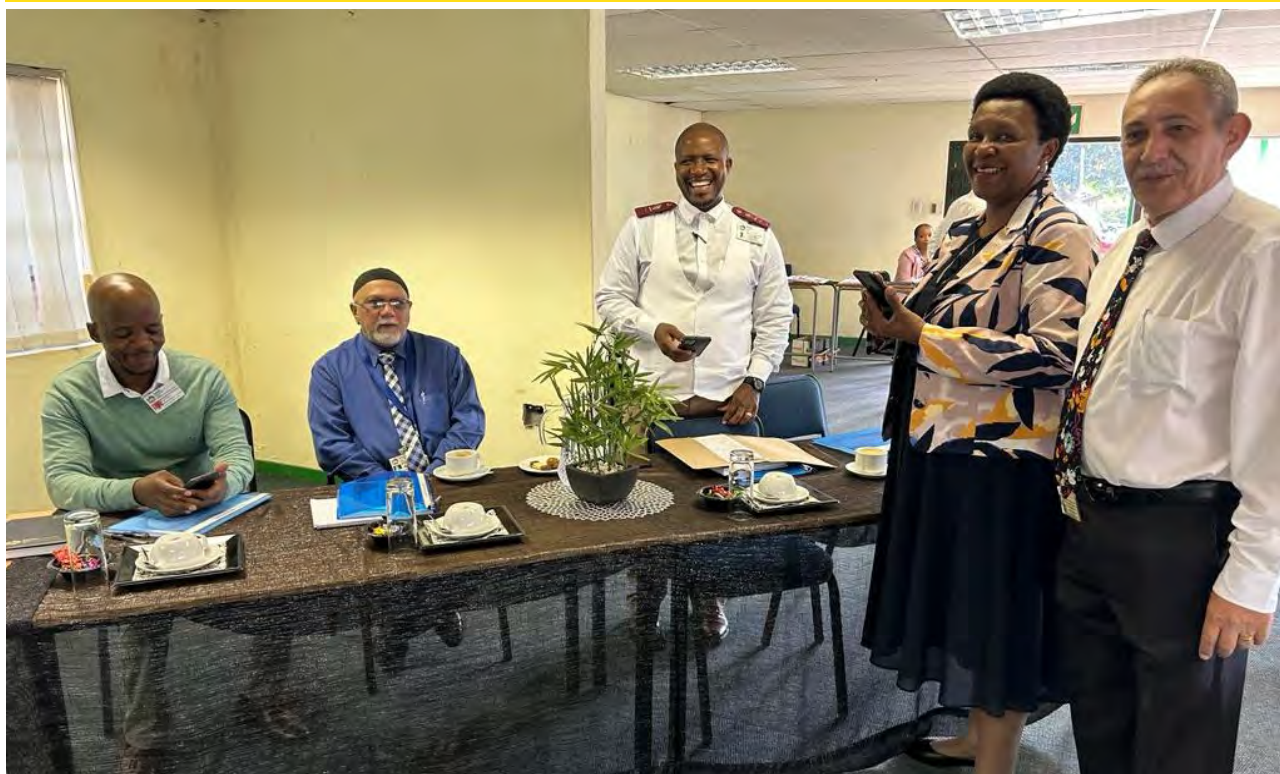
Wentworth Hospital Management before the Meeting

O n The 15th of June 2023, the finance department hosted the Financial performance for the previous financial year and the budget allocation for 2023/2024.