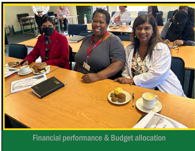
Financial performance & Budget allocation