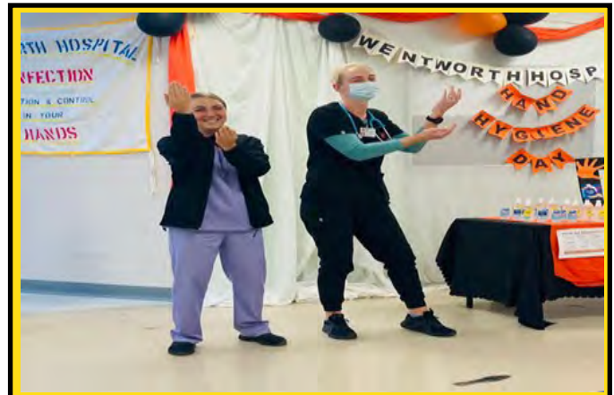
Medical Interns demonstrating hand washing