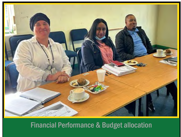
Financial Performance & Budget allocation