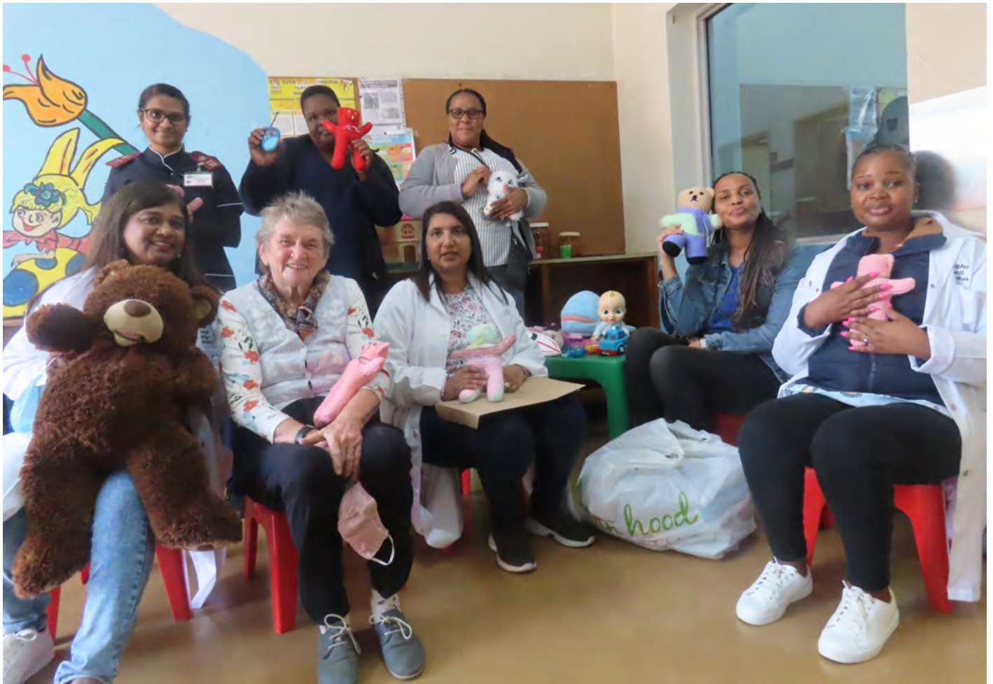
Wentworth hospital social workers with the members of the Robin hood foundation

International Nelson Mandela Day is an annual international day in honour of Nelson Mandela, celebrated each year on 18 July, Nelson Mandela's birthday. The day was officially declared by the United Nations in November 2009, with the first UN Mandela Day held on 18 July 2010.