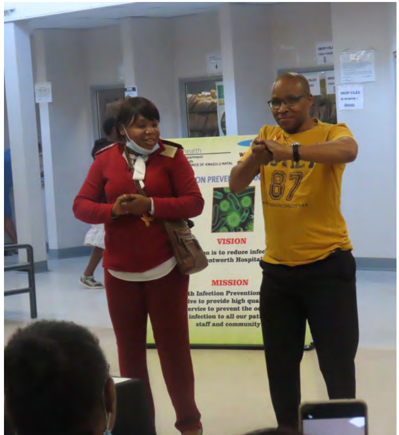
Operational manager's demonstrating the steps of handwashing

Working together with staff in the facility towards the common goal of minimizing health care associated infections and the development of antimicrobial resistance.