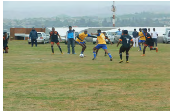
Soccer Match between WWH AND PMMH