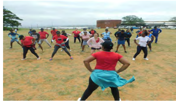
Aerobics session for all staff