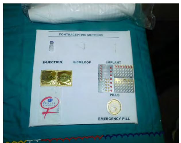
Different types of contraceptives that can be used to prevent unplanned pregnancies