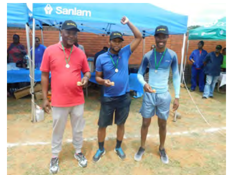
Wellness event Read more on page 10