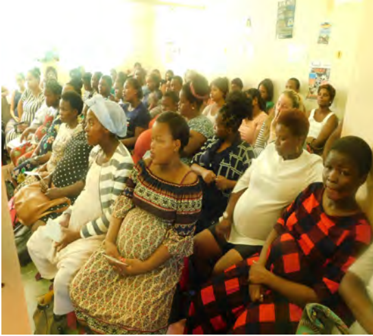
Pregnant Mothers listening attentively to the health talks