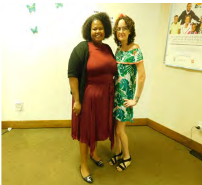
Long service awards Read more on page 03

Wentworth staff members from different units who were awarded certificates for having a long service in the Department of Health