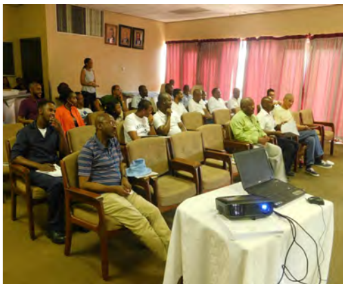
Wentworth Men Listening attentively to Speeches