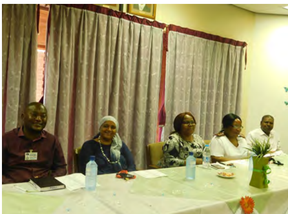
Wentworth Hospital Management