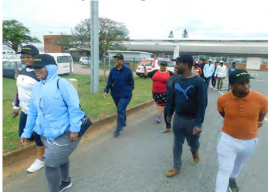
The first activity was a 5km walk within the Hospital