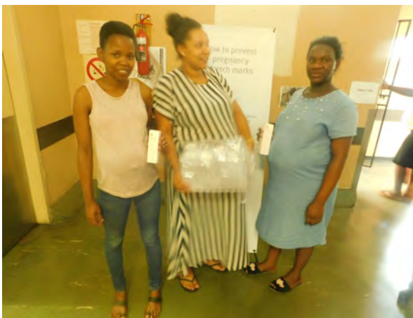
Pregnant Mothers received gifts from Bio-oil