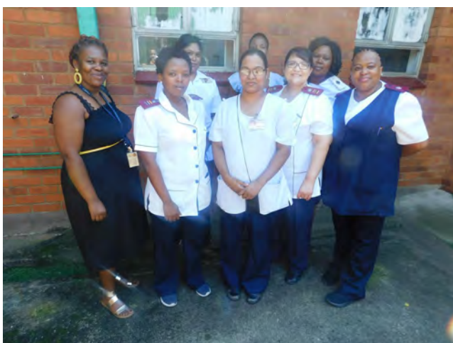
Organisers of the Pregnancy awareness event, from Martenity ward

The moms to be appreciated the information that was shared with them. There was also question and answer time, on what they were taught in , where mothers participated with great enthusiasm and those that gave correct answers were given token of appreciation from Bio-oil.