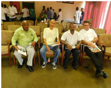
After an informative talks men were served with lunch