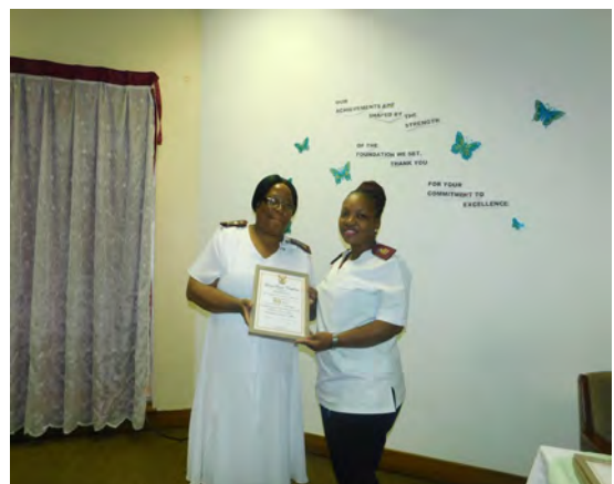
Nursing Manager awarding a 10 year service certificate to a nurse