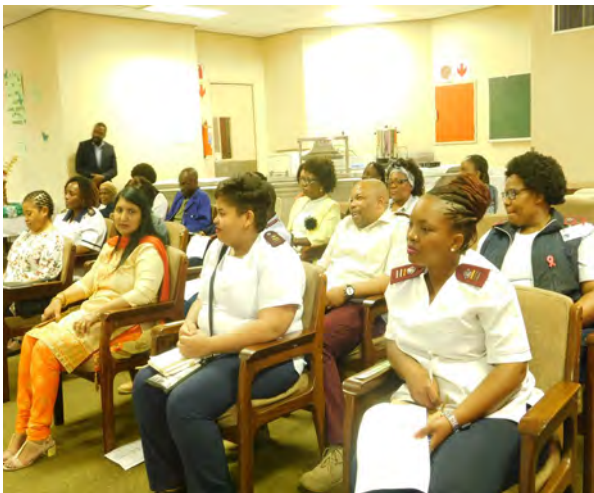
Certificate Recipients listening attentively to speeches