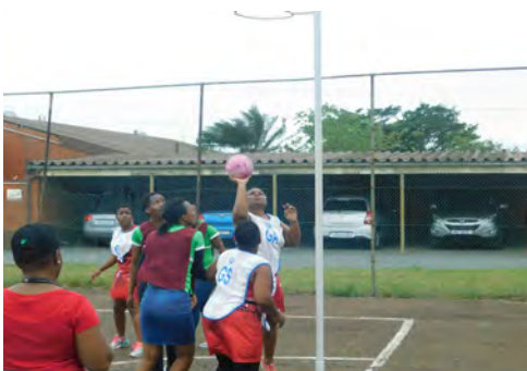
WWH and PMMH Netball game

On the 28/11/2018 Wentworth Hospital hosted Healthy Lifestyle event in partnership with Prince Mshiyeni Hospital. These two facilities were competing against each other in all the sporting codes that were played on the day. Wentworth management welcomed Prince Mshiyen Hospital and they were made to feel at home. The Human resources team organized the sponsors for the event and we had Sanlum, AVBOB, Virgin Active, VW. There were medals given to winners , fruits and water for all participants. The day was full of fun and the cold weather could not stand in the way of making the day a success .