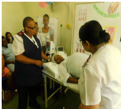
Pregnancy Awareness Event Read more on page 05