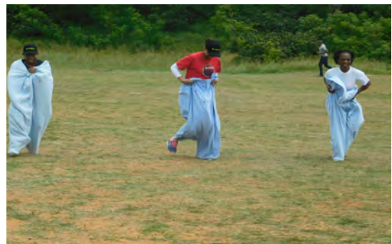
Sack Race staff competing against each