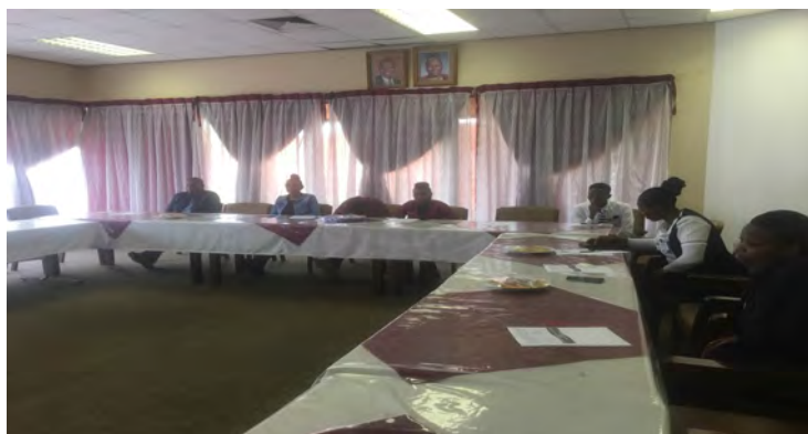
Staff in attendance for the prayer

Theme: 2019 The Year of Abundance, We blow the trumpet of zion