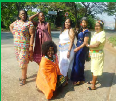
HERITAGE DAY CELEBRATIONS

Wentworth Hospital Gateway Clinic took health services to the community when it hosted an Outreach Programme at Hyme Park in February. Health education, health screening, HIV Tests and counselling, Pap smears, TB screening as well as blood sugar tests were conducted.