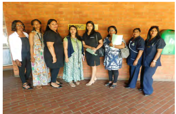
ABOVE: The team of organisers pose with CHWs and external guest speakers.

BELOW: CHWs receiving practical First Aid training.