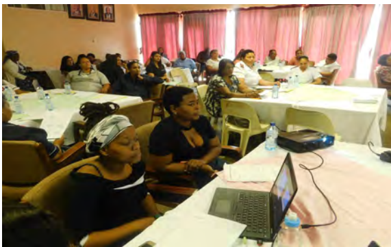
ABOVE: Social Workers look on as demonstrations occur.

The training yielded good fruits as now they have gained lots of knowledge and skills to implement when doing their work out there in the community.