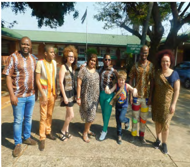
Human Resources staff members in their outfits

Pictured below are Human Resources department, Finance and Nursing divisions looking exquisite in traditional attire.