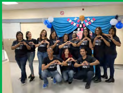
WORLD RADIOGRAPHY DAY