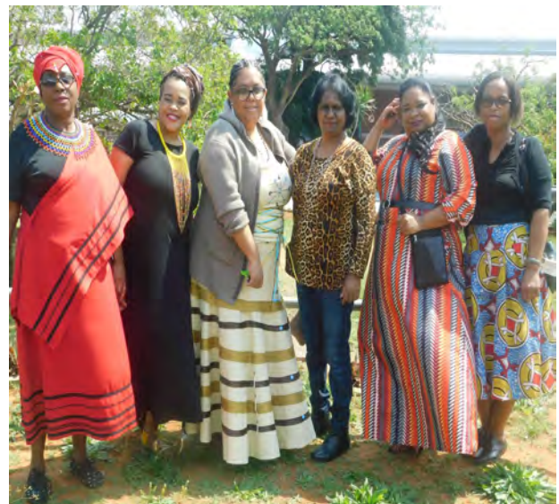
Nursing staff looking beautiful in traditional attire