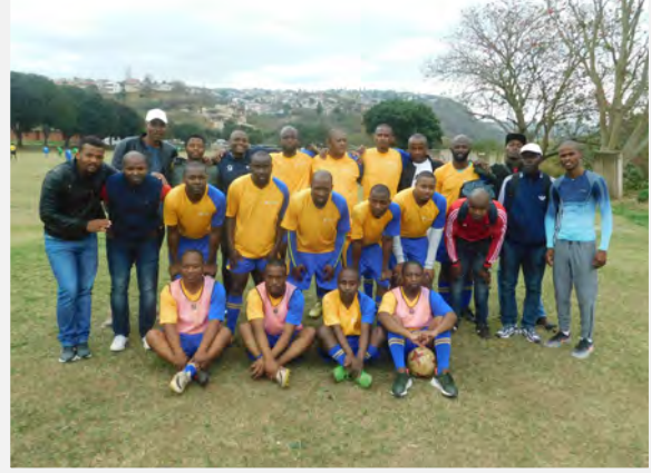
Wentworth Hospital and Orthopaedic soccer team.

On the 17 of August 2018, sports teams from the various institutions within the district descended onto the Reservoir Hills sports fields for the 7th annual soccer and netball EThekweni District tournament.