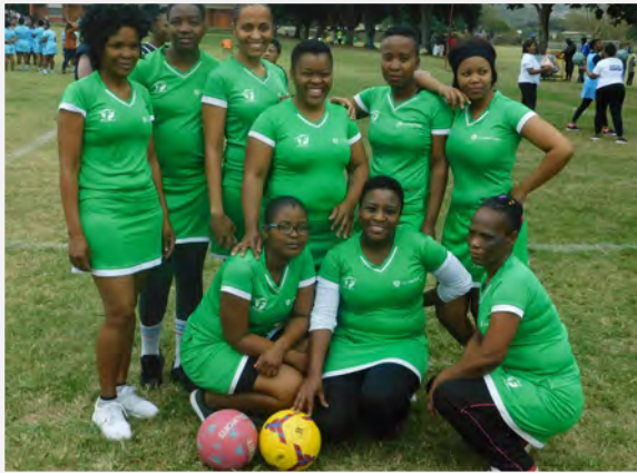
Wentworth Hospital and Orthopaedic netball team.