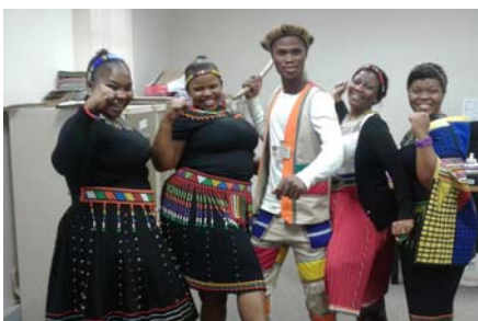
Heritage day ... Read more on page 2