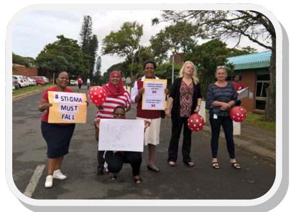
Above Pictures: Staff came out in their numbers to support the march