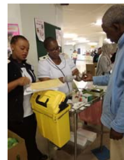
Diabetes day... Read more on page 6