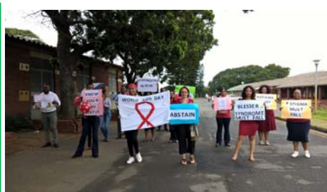
World AIDS Day ... Read more on page 5