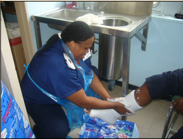
One of the “learners” on her final touches.

The Accident and Emergency department decided to share its best practices with some members of the staff. Some members of the staff had an in-service training on the application and the removal of POP so that everyone in the department can have a knowledge on how to.