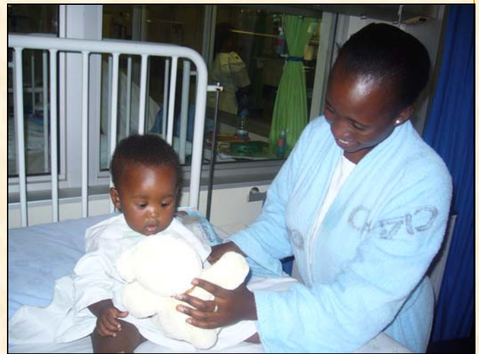
An amazed patient with her mother, after receiving her teddy bear from East Coast Radio .