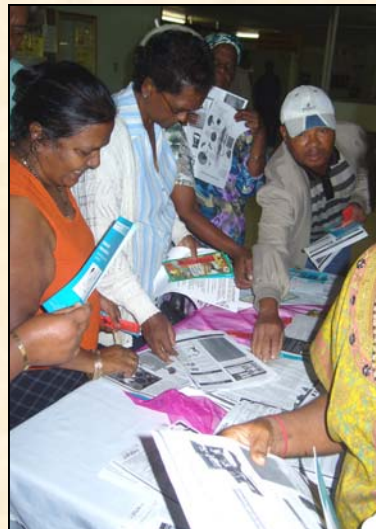
Scramble for information. Patients helping themselves on the pamphlets provided.