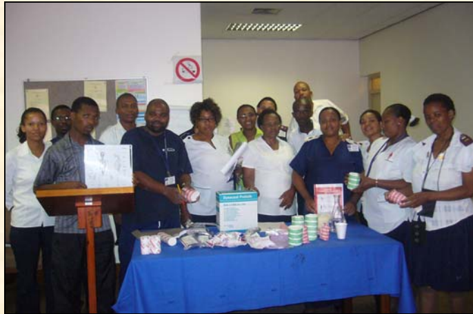
The staff that attended the in-service training on POP