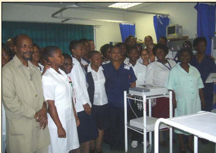
A group photo of the staff from the A&E Department.

Cheers to the A&E (Accident and Emergency) department for obtaining 100% in their in-service training. The department managed to involve all categories of the staff, from professional nurses to potters. They had a higher number of topics discussed than any other department. To the A&E department, Cheers to you.