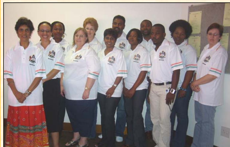
The A team: A group photo for the Human Resource personnel team.

At a later time, the staff had the opportunity to view the different tables and to ask questions. Most queries were settled at the spot. A suggestion box was also made available for those who prefer to put their queries in writing.