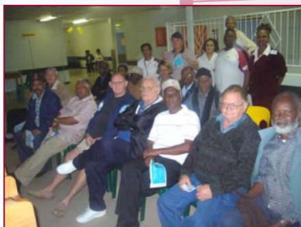
Some of the patients who attended.

CANSA obtained the test kits from Abbott laboratory and the blood was analyzed by Bouwer and partners a private laboratory. Patients were educated about the groups that are mainly affected by testicular cancer they are: Men with a family history of testicular cancer or those with fertility problems. The men that attending the testing were also informed that they should spread the information to other family members and friends as early detected testicular cancer can be treated and cured faster. This is a very rare kind of cancer in men and can occur in men between the ages of 20-40 years and the cause is unknown.