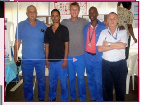
ABOVE: The Maintenance team from the Workshop department that helped make the Open Day a success.