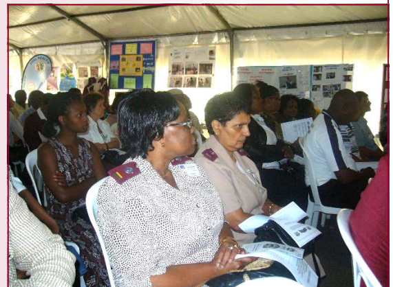
Guests, during the open day, listening to the speakers

(clinics) are a first step in the level of health care.