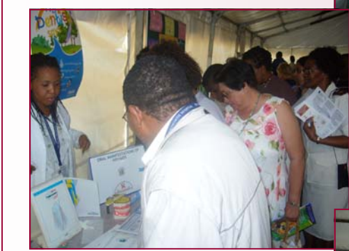
LEFT: Guests viewing the stall of the Dental Department.