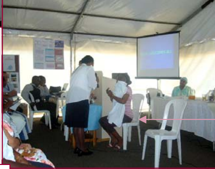
RIGHT: The staff from ward C4 performed a role play and had everyone laughing.