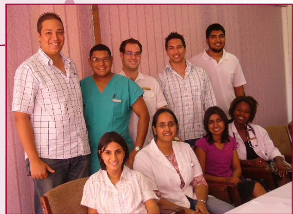
The Intern doctors that left.

“YOU CANNOT FLY WITH THE EAGLES IF YOU SCRATCH WITH THE TURKEYS..”