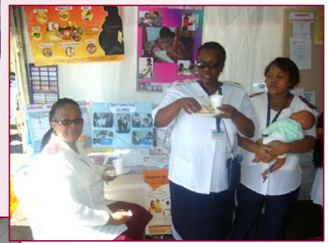
ABOVE: Sisters from the ante-natal clinic and labour wards enjoy the refreshments served.