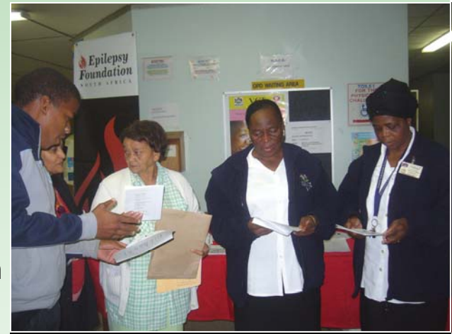
Scramble for information on Epilepsy