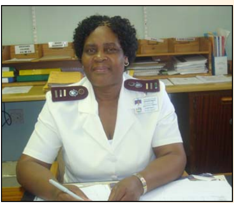
sincere gratitude to all Wentworth employees for their great contribution to the achievement of our mission and objectives as mandated by the Department of Health.