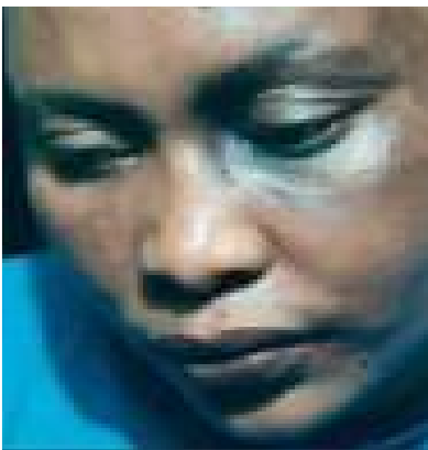
A battered woman, Many females are abused but few cases are reported

The 16 Days of Activism is an international campaign against violence against women and children, run from the 25th of November to 10 December annually. Wentworth Hospital commemorated this day by educating patients on different kinds of abuse and on where to get help.