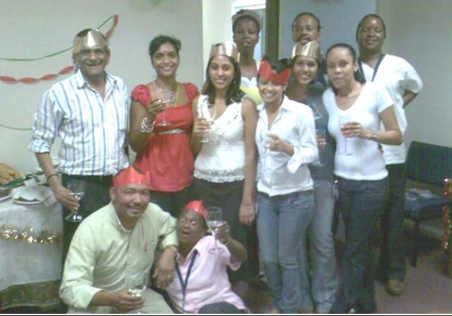
Cheers to the year: The X-Ray staff during their end of year party