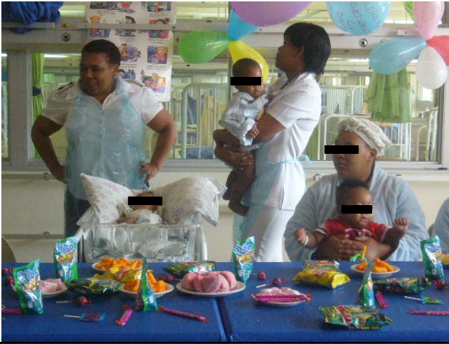
Staff from Ward C4 partake in the celebrations with the excited little kids

The children's, Ward C4 had a children day celebration. This day was specially celebrated so as to educate, inform and instill to parents the importance of such a day. They (parents) were educated on children's rights and responsibilities. In her speech, the sister in charge of the ward pleaded with parents to take extra care of their children. To protect them from any form abuse which could be emotional or physical. All the guests were treated to a beautiful lunch.