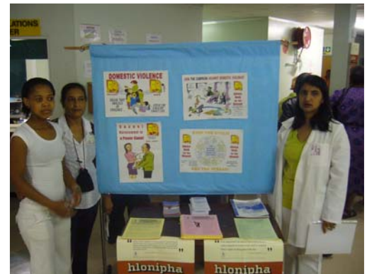
Demonstration from the social workers and the health promotional department

Violence can be physical (punching), sexual (rape) and verbal (threat to harm, repeat insults meant to demean and erode self esteem, financial (taking away a woman's wages or other income and even emotional. When someone is being abused she can report it to the relevant authorities like the police, social worker or doctor etc.