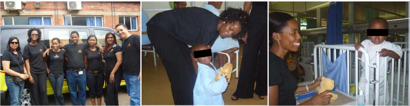
From L to R: East Coast radio crew after they had delivered the presents, East Coast radio crew with some of the recipients.

The Durban's radio number one station came bearing gifts for our young ones. It was a humbling experience to witness Joy and happiness written on their faces when they were given their presents. East coast managed to put a smile on the little faces that are too tired to smile as they delivered a ray of light and a moment of joy to the children. The management and the staff of Wentworth hospital would like to thank East Coast radio and individuals who donated towards this initiative on their generosity, thoughtfulness and time.