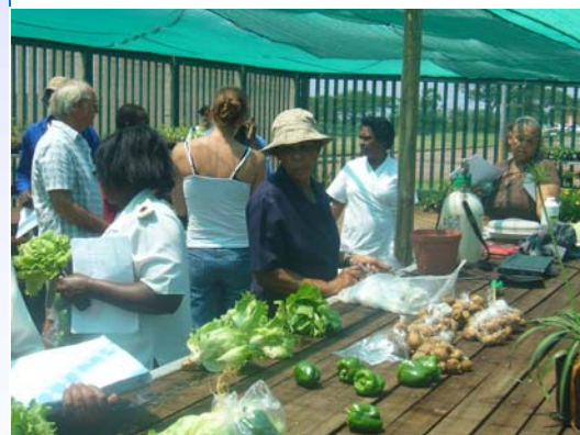
A number of people attended the garden workshop

They wanted to re-enforce the culture of having a vegetable garden at homes as the cost of living has risen tremendously.