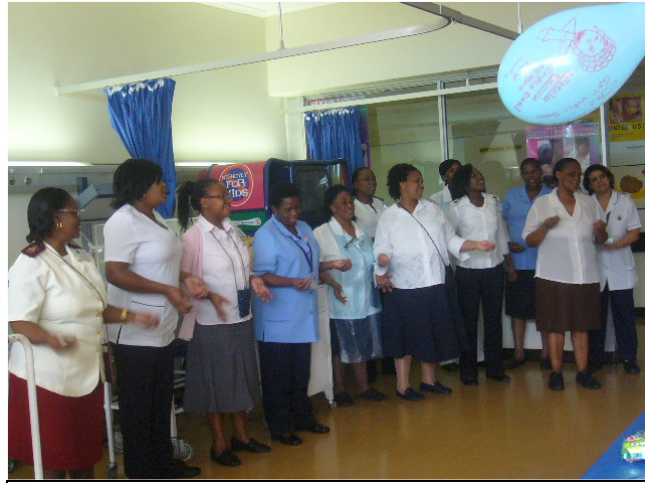
The ward staff choir belts out a few harmonious melodies in honor of this day