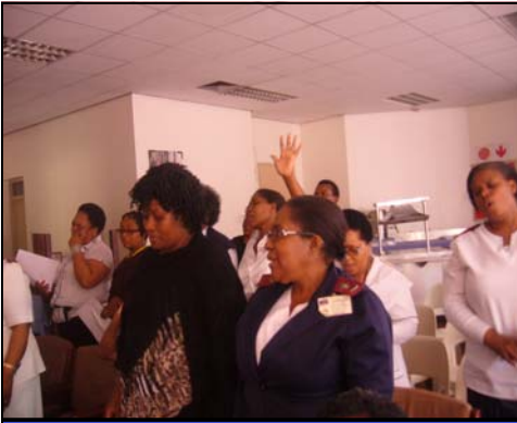
Staff members who attended the woman's prayer day.