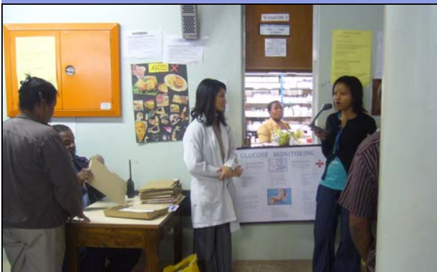
Pharmacist educating patients on the proper taking of medication.

and quality of life. They also encouraged patients to keep to their dates of collecting medication as it has great effect on persons health and for every patient to know their medicine by names.