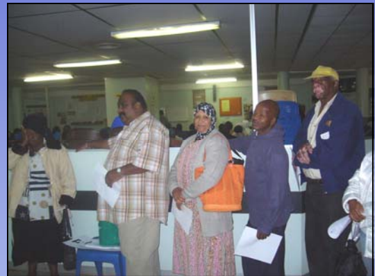
Patients waiting to have their eyes screened.

After the eye screening was done patients who were found to have problems with their eyes were referred to the hospital eye clinic for a full assessment and some were advised some were advised to see the eye specialist.