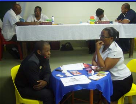
My advice is: One of the staff members getting all the information

The HRD practitioner in conjunction with the Public relations department organized a wellness day for the staff. The purpose of this day was to show our staff that they are highly appreciated by giving back to them. This also provides an opportunity to boost the morale of staff members as they see that somebody cares for them.