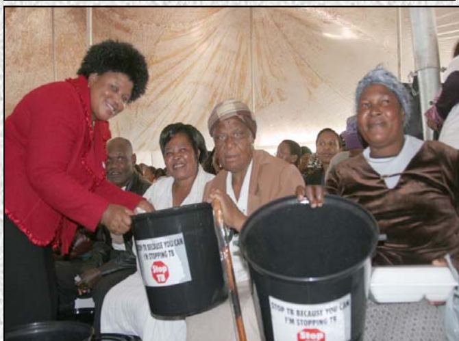
Ungqongqoshe weZempilo KwaZulu-Natal wamukelisa izipho ezifundisa/eziqwashisa ngesifo sofuba emphakathini wakwaNobamba.