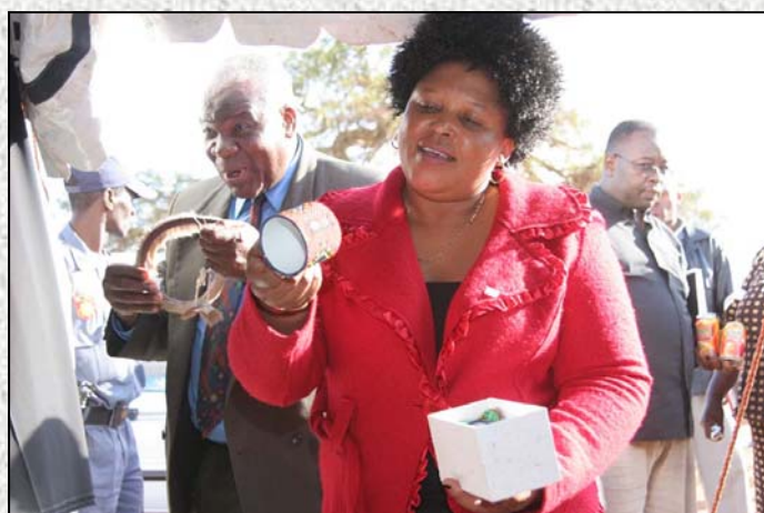
Ungqongqoshe weZempilo KwaZulu-Natal ebuka imisebenzi yezinhlangano zosomabhizinisi abancane ngosuku lomcimbi kwaNobamba.