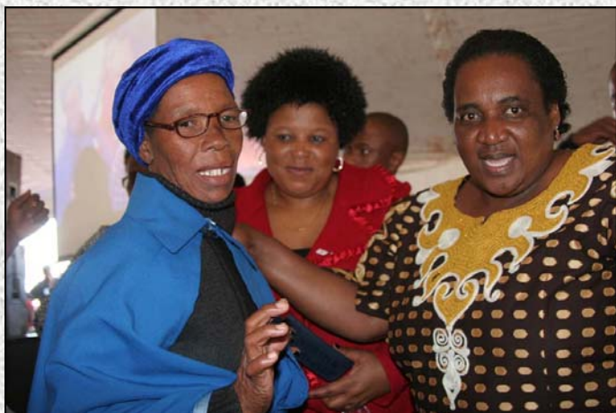
Injabulo ibibhalwe emehlweni kugogo ngenkathi ebona ungqongqoshe engenisa emzini wakhe ongomunye wemizi eyabe isohlwini lokuvakashelwa.