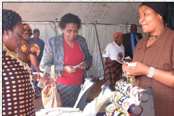
Izikhulu zoMnyango weZempilo zibuka imisebenzi yezinhlangano zosomabhizinisi abancane bendawo ngosuku lomcimbi kwaNobamba.