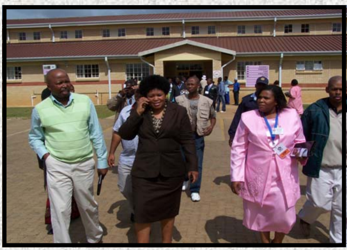
Ungqongqoshe nezinye izikhulu zomnyango behamba ngaphakathi esikhungweni bebuka ubuhle baso