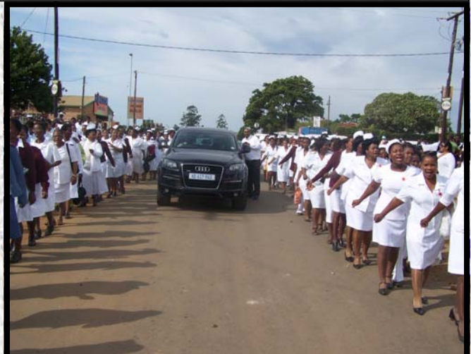
Nurses from all Districts leading way for the newly appointed MEC for KZN Health to the Stadium