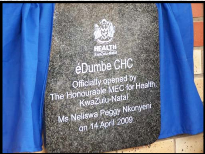
Yilo lelitshe eliqoshiwe elavulwa ngungqongqoshe nomphakathi waseDumbe