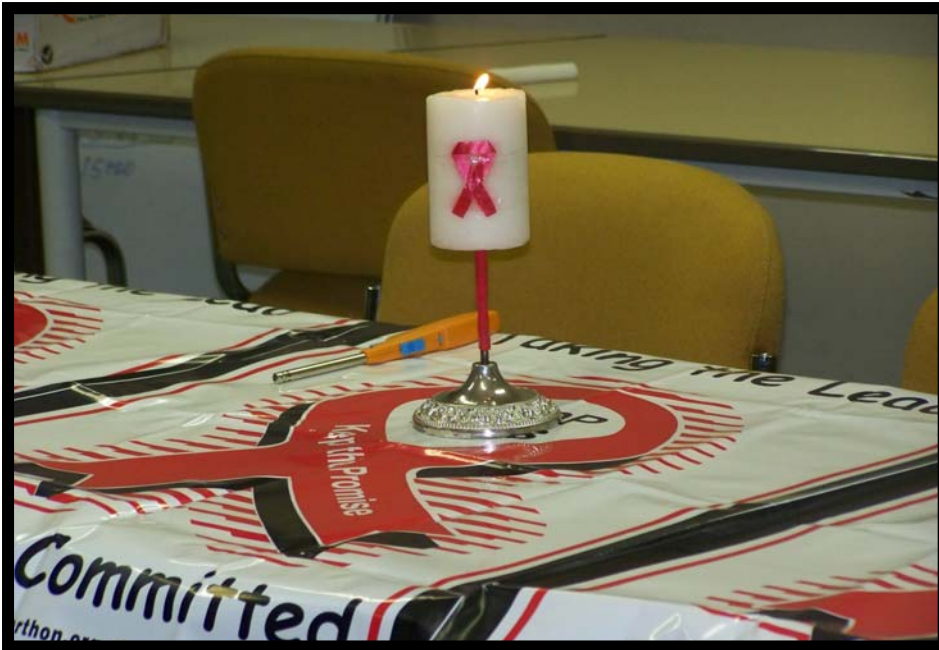
Yilo lelikhandlela elokhelwa ngabasebenzi bomnyango weZempilo

Isifunda saseZululand sihlela usuku lokokhelwa kwekhandlela. Lelikhandlela lisuke liqondaniswe nomkhankaso wokulwa nesndulela ngculazi nengculazi uqobo