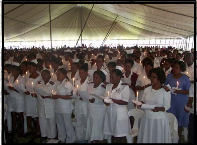
Health professionals/ KZN Provincial nurses reading the Nursing pledge