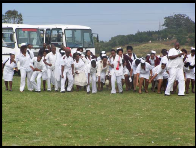
It was joy and happiness during the Nurses Day of Prayer at Hlabisa Stadium. Nurses were singing and chanting their slogans