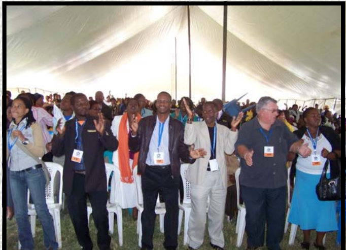
Injabulo ibhalwe emehlweni emphakathini wase-Dumbe