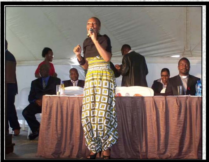
UNkksz NomUSA Njoko ejabulisa izihlwele zakhe ngomculo wakhe.