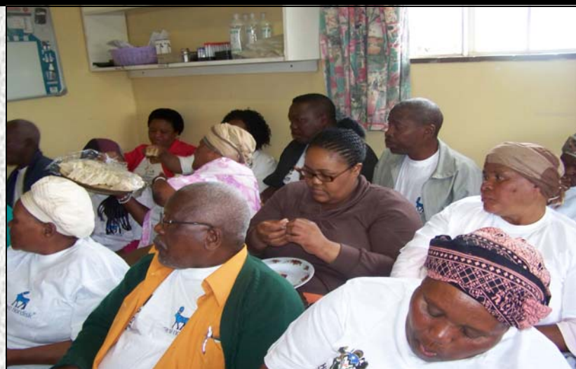
Diabetic patients having lunch after the Diabetic Awareness day at Mdumezulu Clinic

According to the department of Health calendar, the 9th to the 14th of November is regarded as the diabetes week. On the 10th of November the District Office organized the Diabetes awareness day which was held at Mdumezulu Clinic. The people who attended the event are those who have been diagnosed as