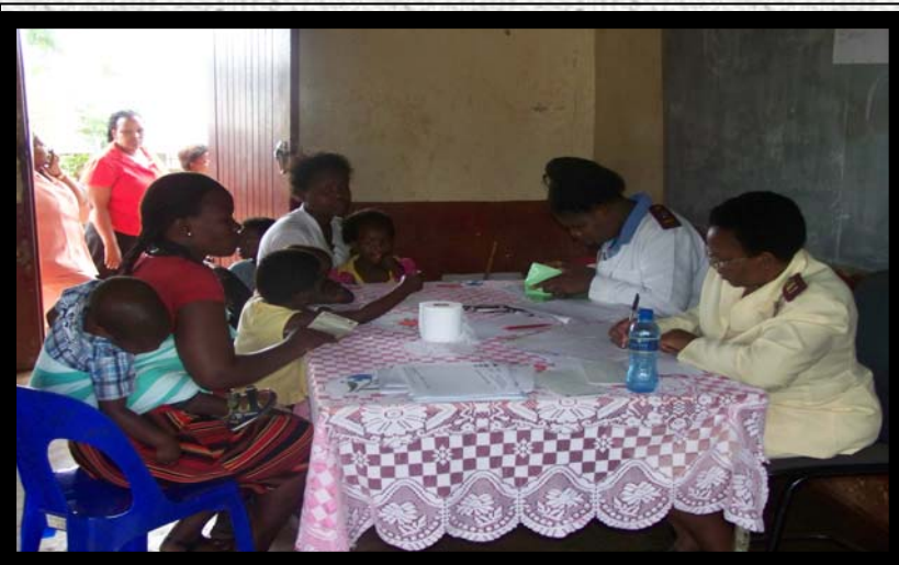
Omama bebephume ngobuningi ukuhambisa izingane zabo ukuyothola usizo lweZempilo.