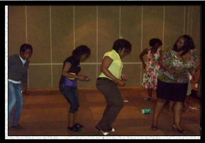
Staff members were enjoying themselves during the party.