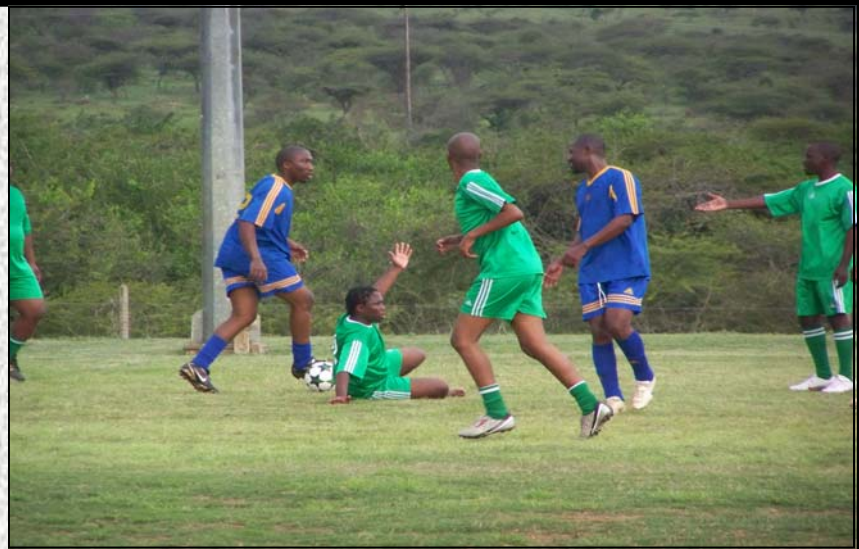
Kwakusala phansi indoda emidlalweni wobungani Phakathi kwabafana bomnyango weZempilo nabomnyango Wezemisebenzi kaHulumeni.

Kubukeka sengathi uzobuya umfutho wokudlala ibhola kubafana abadlalela isifunda seZempilo saseZululand. Kuleminyaka edlule umnyango weZempilo ubuhlale uhlela imidlalo yobungani lapho izibhedlela ezingaphansi kweSifunada beziyaye zizwane khona amandla. Ngemuva kwemidlalo yeSifunda bkuyaye kulandele eyesiFundazwe sonke lapho lemidlalo ibisuke yethanyelwe nguNqgongqoshe. Kodwa ke konke lokhu kwabe sekushabalala ngenxa yokwentuleka kwezimali eminyangweni nase-muhlabeni wonke jikelele. Abadlali kodwa bona basenalo lthemba lokuthi kuzolunga lokhu kufakazelwa ngukuthi abayekile