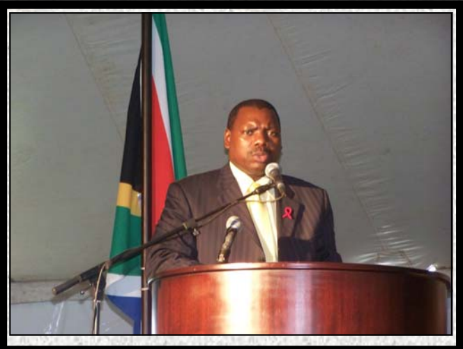
UNdunankulu waKwaZululu Natal U Dkt Zweli Mkhize ethula inkulumo yakhe yosuku