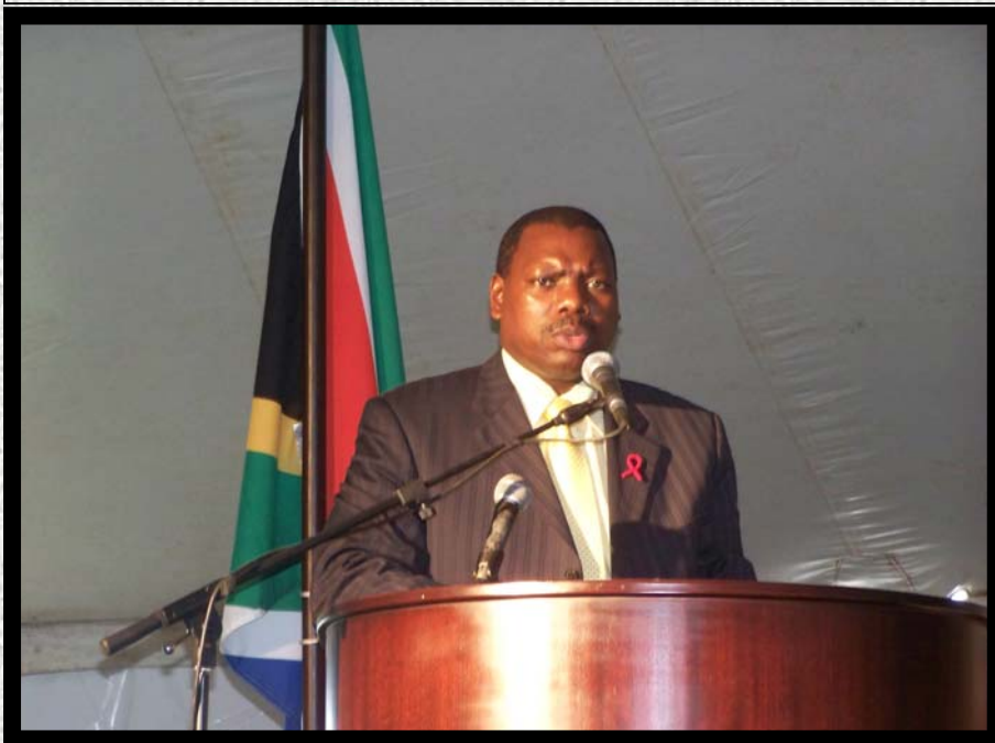
uNkunankulu waKwaZulunatal uDokotela Zweli Mkhize ethula inkulumo yakhe yosuku endaweni yaseNsukazi ngenkathi kuwusuku lokukhunjulwa kwalabo abahaqwe nabahlukunyezwe yisifo sengculazi

Lubukeka luzoba impumelelo uhlelo lokusebenzisana kweminyango kaHulumeni esifundeni sase Zululand. Lokhu kuvele emicimbini engaphezu kowodwa eseyike yenzeka yokuyisa uhulumeni kubantu ikakhulukazi labo abadla imbuya ngothi.