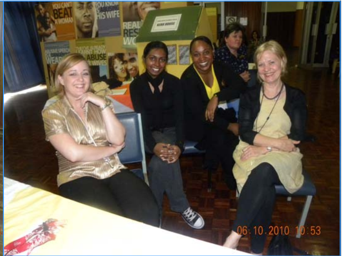
PSYCHOLOGY DEPARTMENT: STAFF