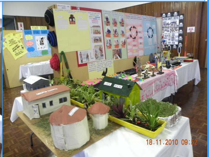
REGISTRY POSTER PRESENTATION