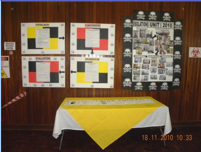
INFECTION PREVENTION AND CONTROL POSTER PRESENTATION