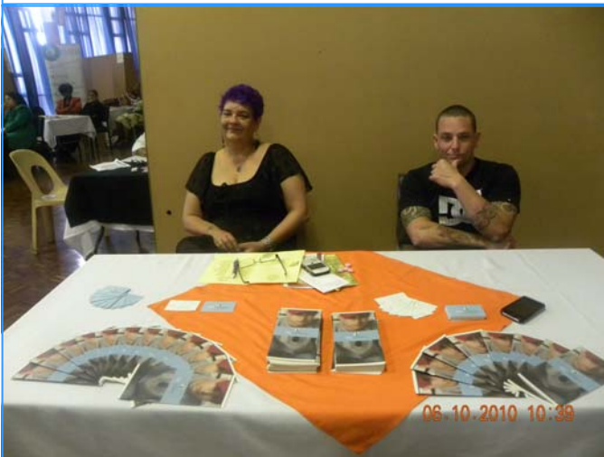
STALL FOR CEDARS