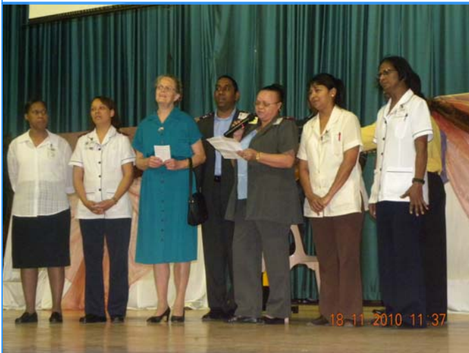
ENTERTAINMENT BY STAFF