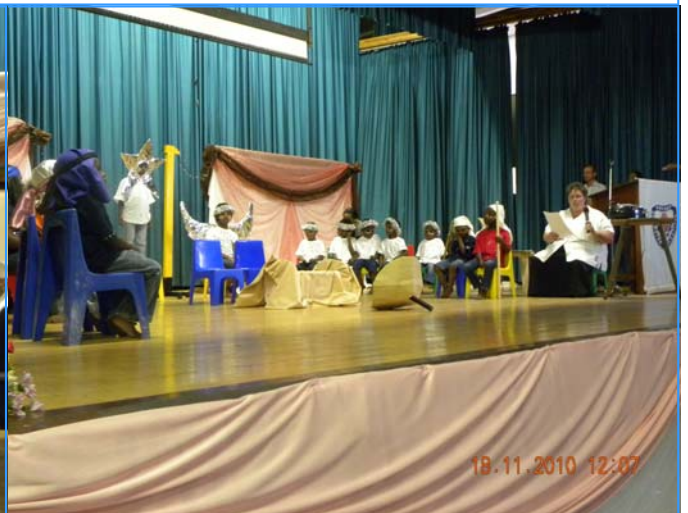
CHILDREN FROM THE BLIND SOCIETY ENTERTAINING AUDIENCE