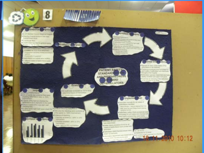
QUALITY ASSURANCE POSTER PRESENTATION