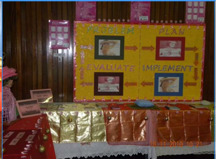
WARD 3A POSTER PRESENTATION