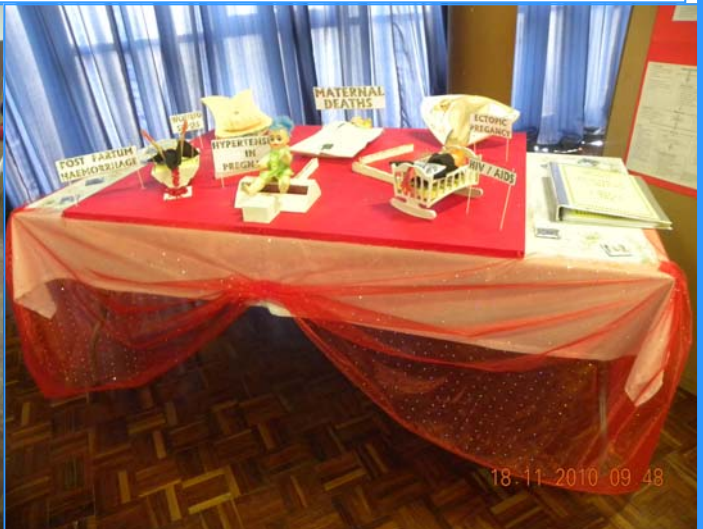
WARD 7A POSTER PRESENTATION