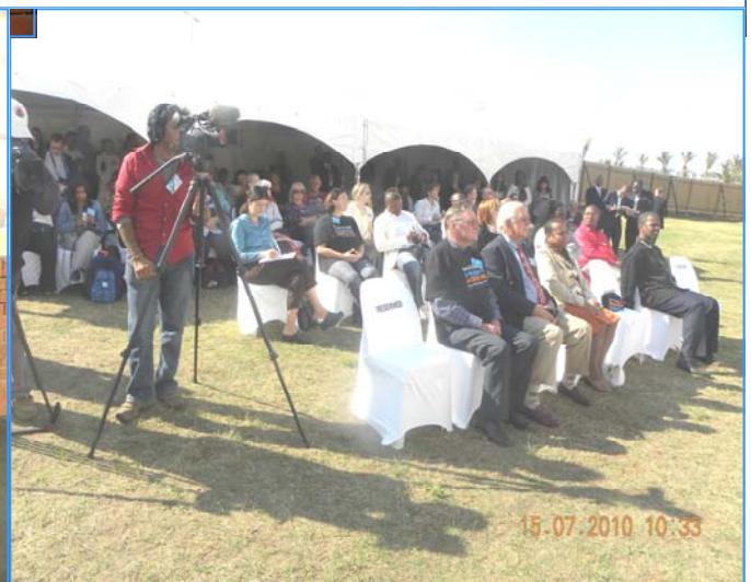
INVITED GUESTS LISTENING TO KZN MEC DELIVERING THE SPEECH

The Addington Hospital staff is pleased to know that there will be revamping of the old KZN Children Hospital.