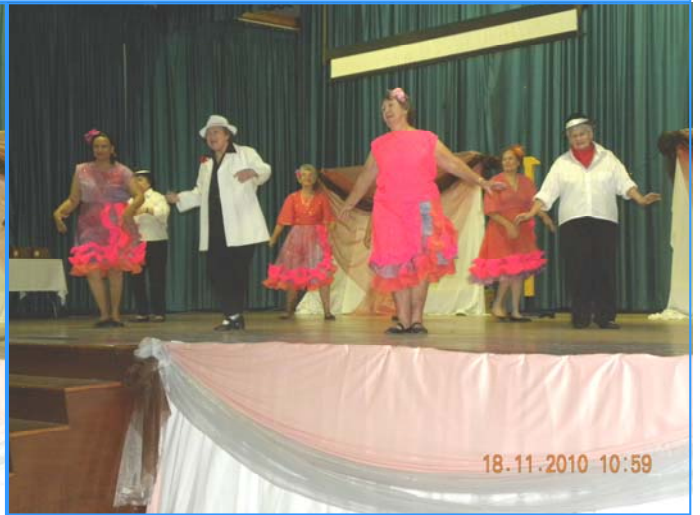
TAFTA ENTERTAINING AUDIENCE