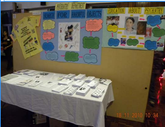
PSYCHIATRY DEPARTMENT POSTER PRESENTATION