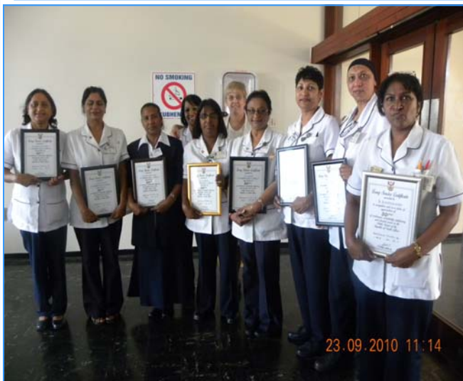
30 YEARS OF UN BREAKABLE SERVICE