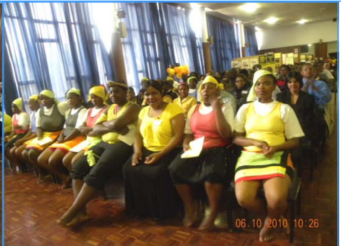
AUDIENCE PATIENTLY LISTENING TO THE PRESENTATION

The Psychiatry Mental Health Awareness Day was held at the Centenary Hall and was organized by the Psychiatry and the Social Work Department