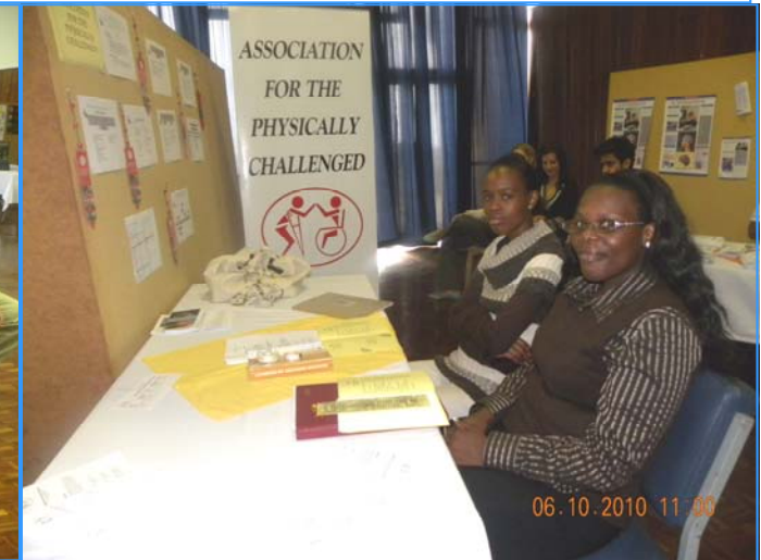
STALL FOR ASSOCIATION FOR PHYSICALLY CHALLENGED