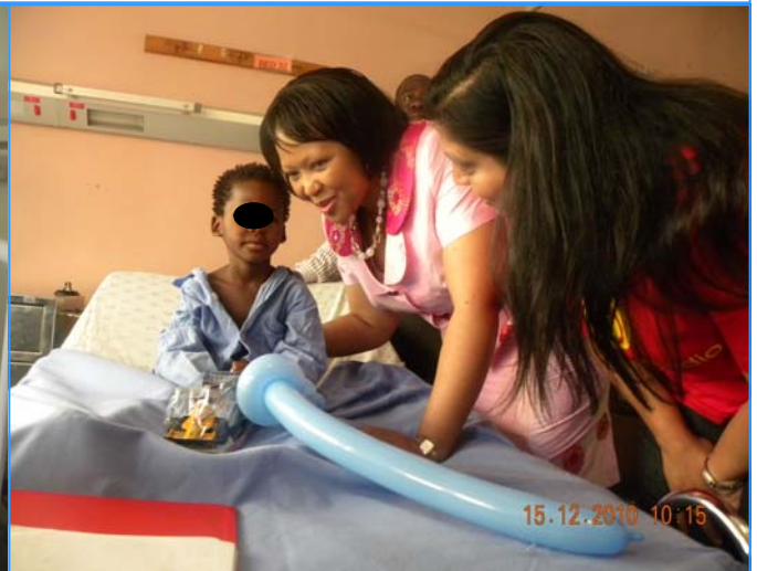
President's Wife spending some time with the children

T he President's wife, Thobeka Zuma visited Addington Hospital to handover toys and gifts to the Children's Ward, that is, Ward 13 "A"