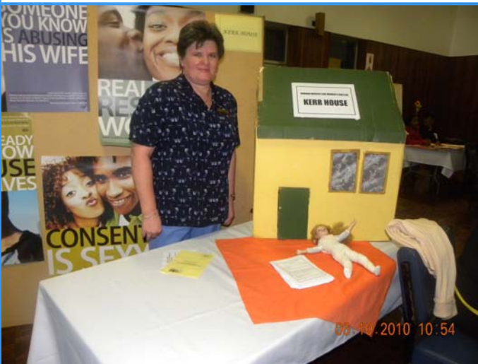
KERR HOUSE: STAFF