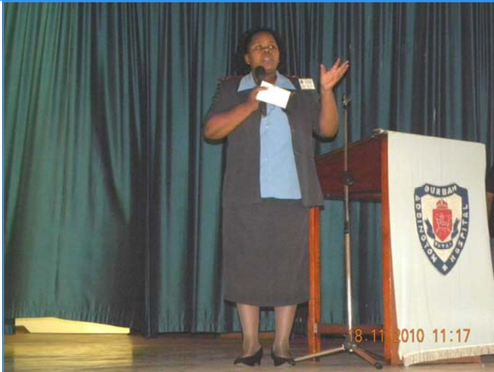
ORAL PRESENTATION BY 2B SISTER KHATHI