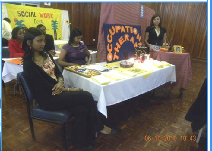
OCCUPATIONAL THERAPY STAFF