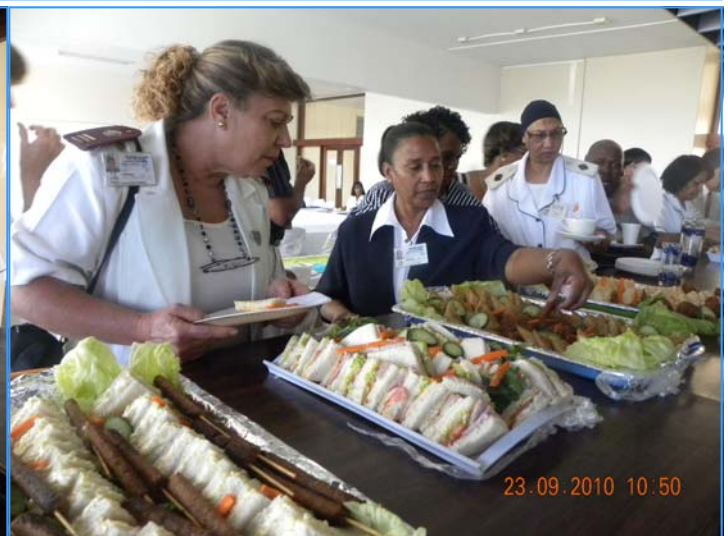
STAFF ENJOYING AFTER THE OCCASSION