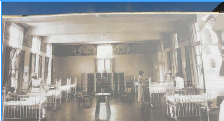
OLD KZN CHILDREN HOSPITAL WAY BACK IN 1931