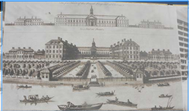
OUTSIDE VIEW OF THE OLD CHILDREN HOSPITAL