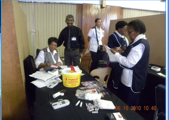
STAFF: TAKING VITAL SIGNS