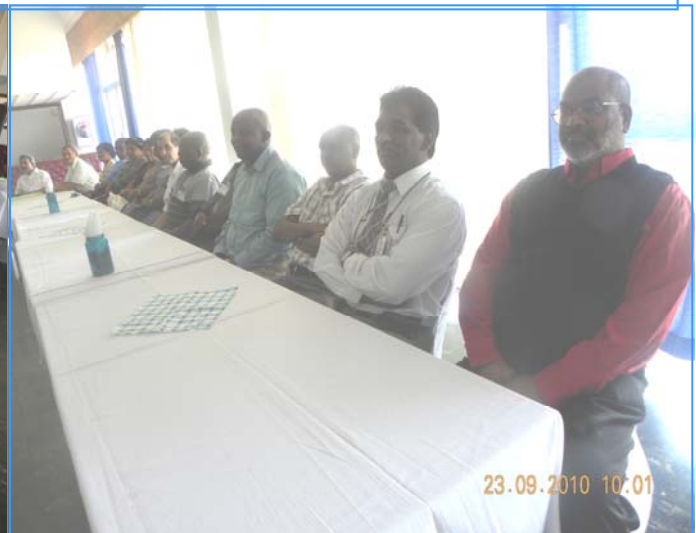
STAFF MEMBERS RECEIVING THE LONG SERVICE AWARD