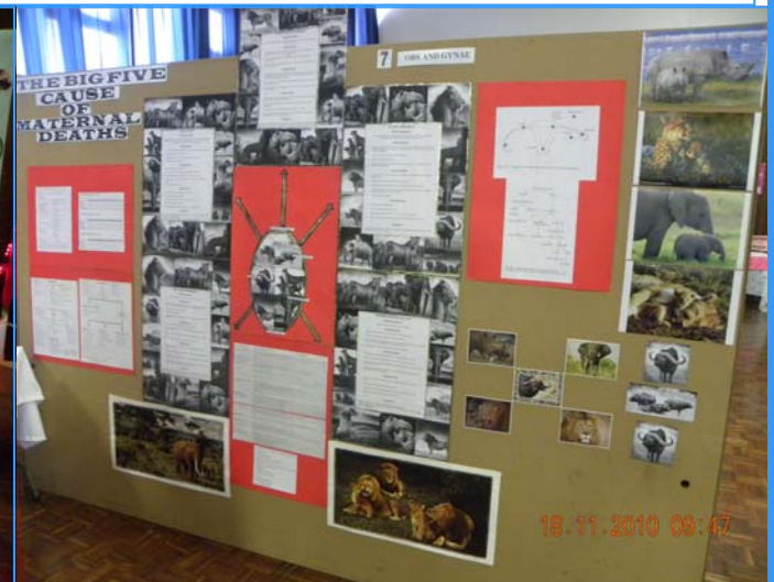
WARD 7A POSTER PRESENTATION