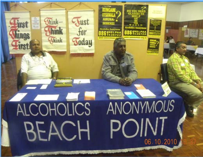
AA STALL ISSUING PAMPHLET & INFORMATION