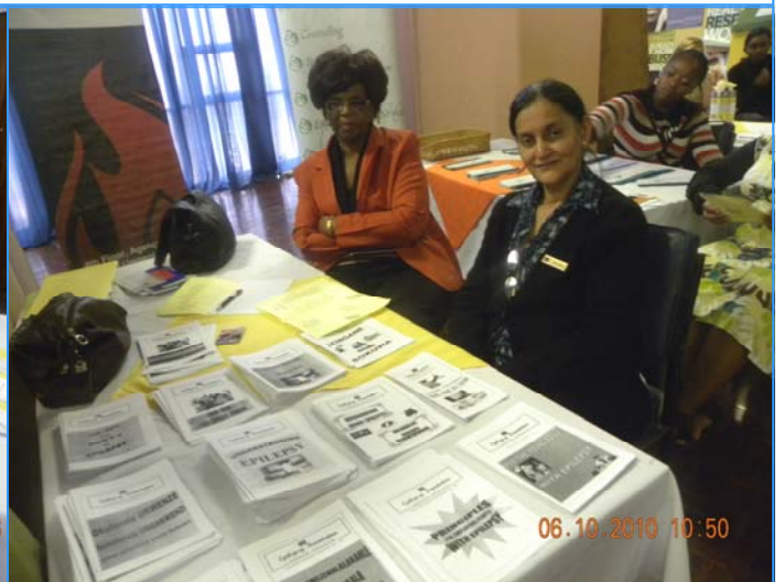
EPILEPSY FOUNDATION: STAFF