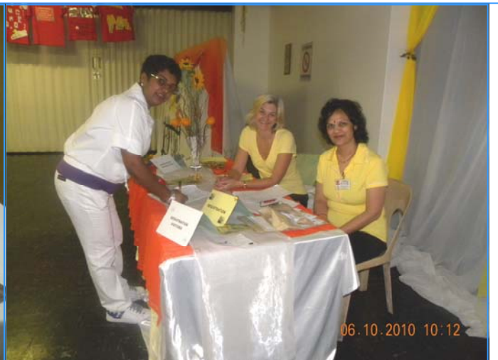
REGISTRATION: SOCIAL WORKERS