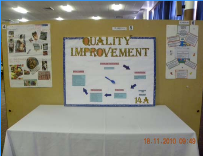
14A WARD POSTER PRESENTATION