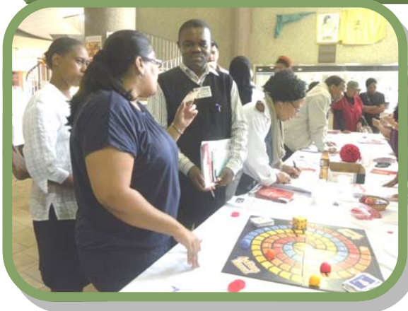
Staff attending the Epilepsy Event