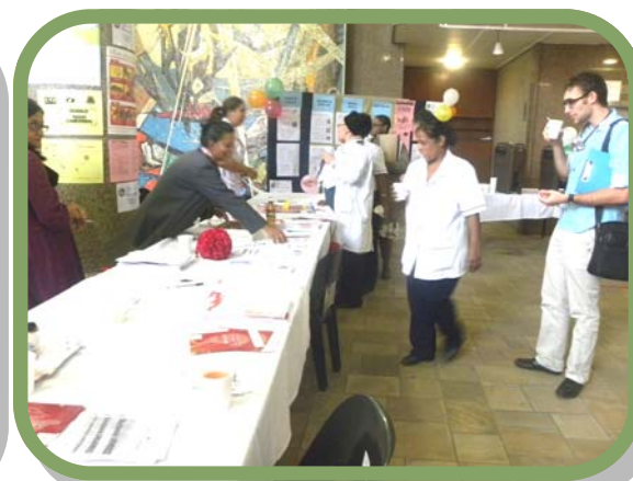
Staff attending the Epilepsy Event