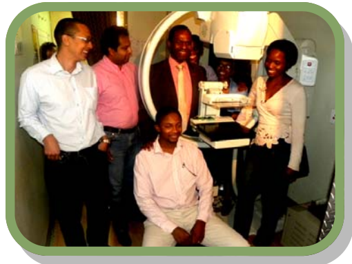
MEC and The Radiography Team