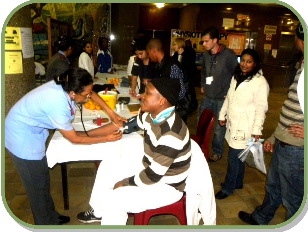
Addington Staff Checking Vital Signs

The Addington Employee Wellness Day was held on 5 July 2013 at the Addington Hospital Main Foyer.