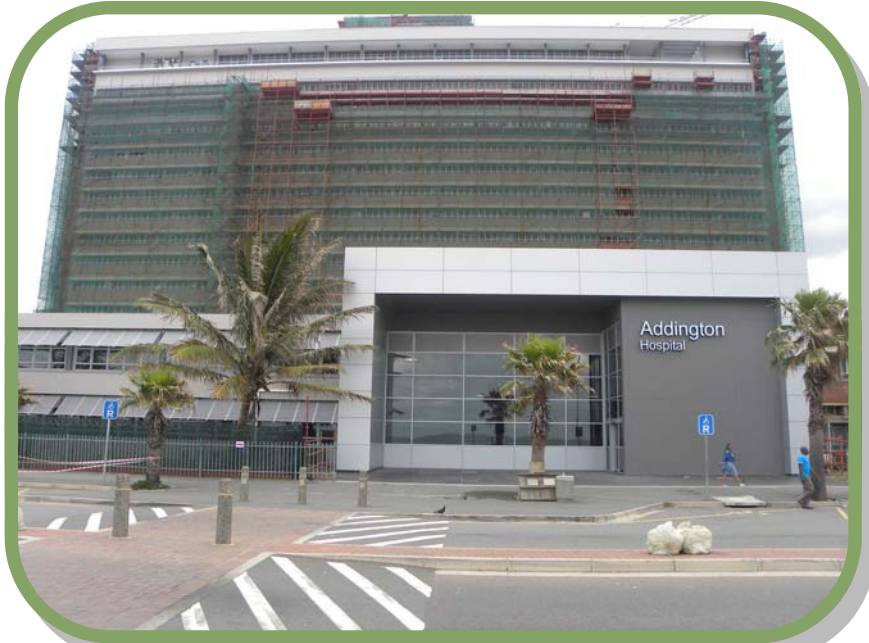
Addington Hospital external façade upgrade