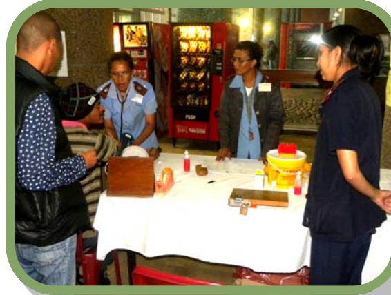
The Staff is being screened