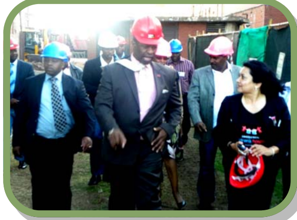
MEC going to the Construction Site