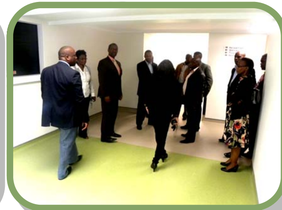
MEC viewing the Construction Site