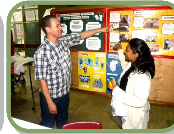
Health Education given to Staff