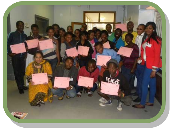
UNISA Students attending the Survey

In 2010 the Ethekwini District Office coordinated and funded the Artisan related programmes offered by the FET College.