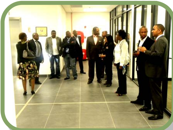
MEC viewing the Construction Site