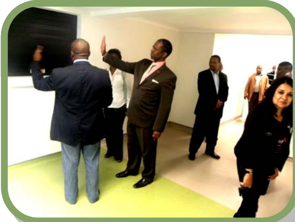
MEC viewing the Construction Site