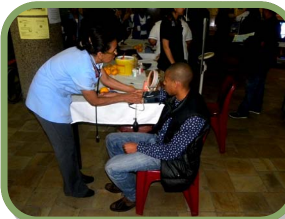
Addington Staff Checking Vital Signs