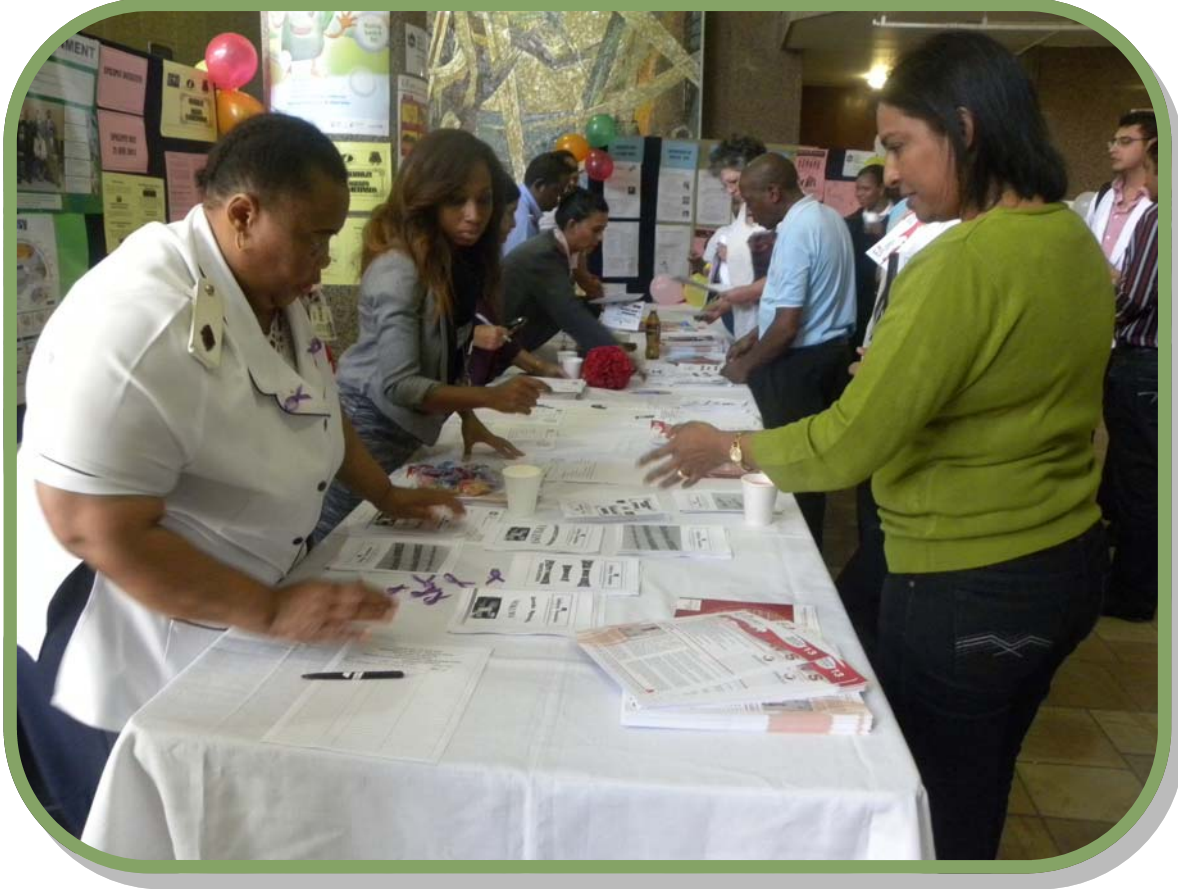
Staff attending the Epilepsy Event

The Addington Staff came in numbers to attend the Epilepsy Event..