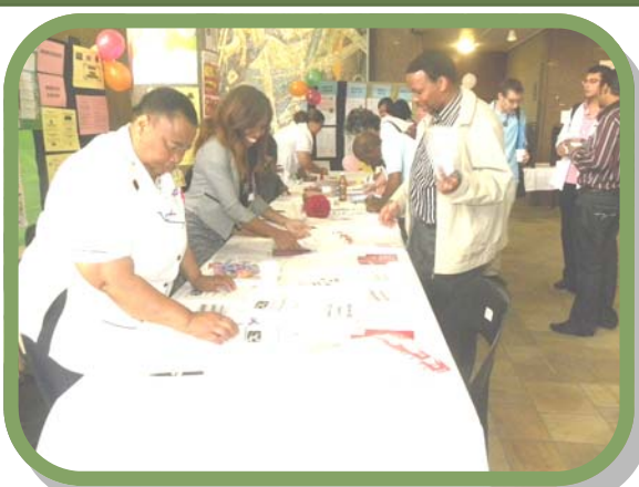
Staff attending the Epilepsy Event