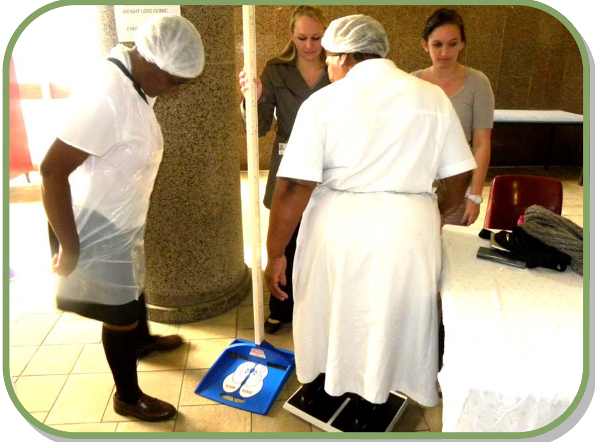
Dietetics Team Screening Body Mass Index to Staff

The Dietetics Department organized a Weight Loss Clinic Event for Addington Staff.