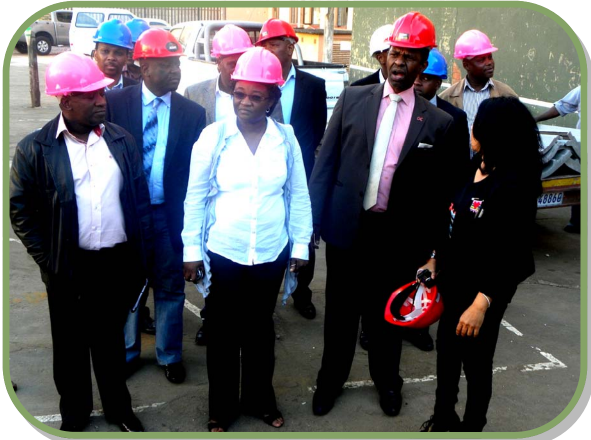
KZN Health MEC , Dr Sibongiseni Dhlomo and the Management Team