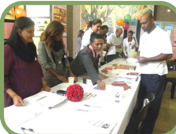
Staff attending the Epilepsy Event