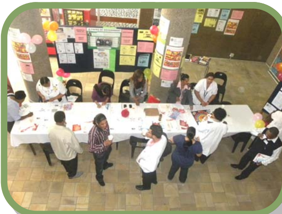
Staff attending the Epilepsy Event