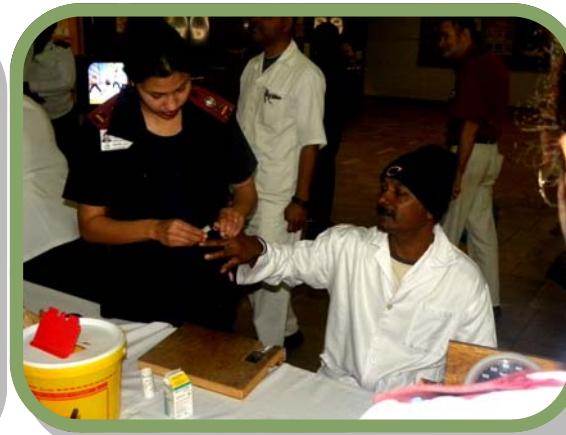
Addington Staff Checking Vital Signs