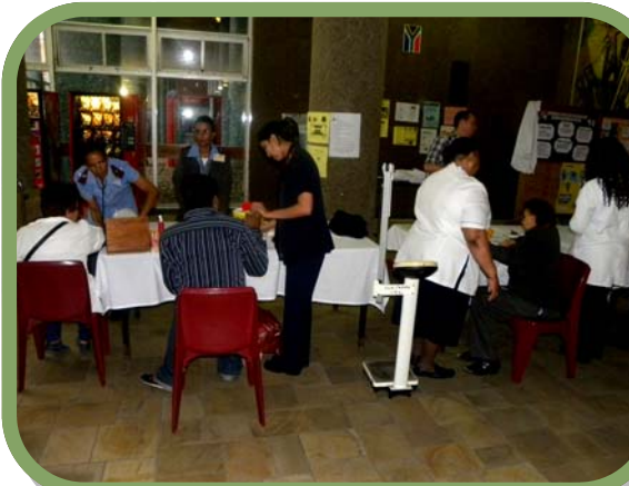
Addington Staff Checking Vital Signs