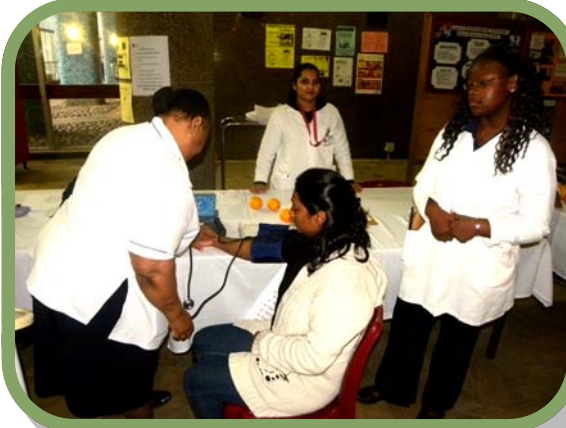
Addington Staff Checking Vital Signs