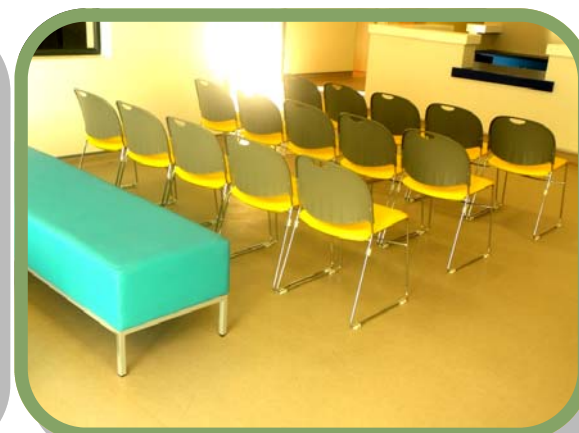
Patient Waiting Area