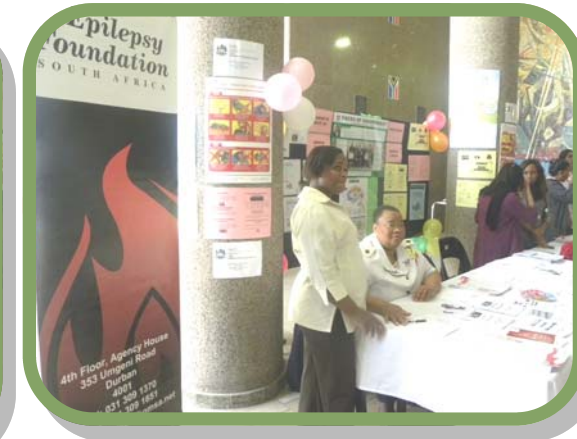
Staff attending the Epilepsy Event