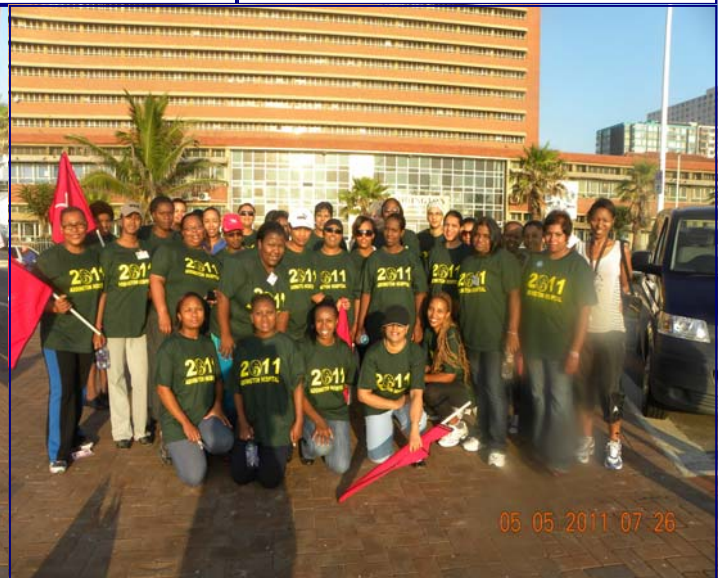
MIDWIVES TAKING A WALK