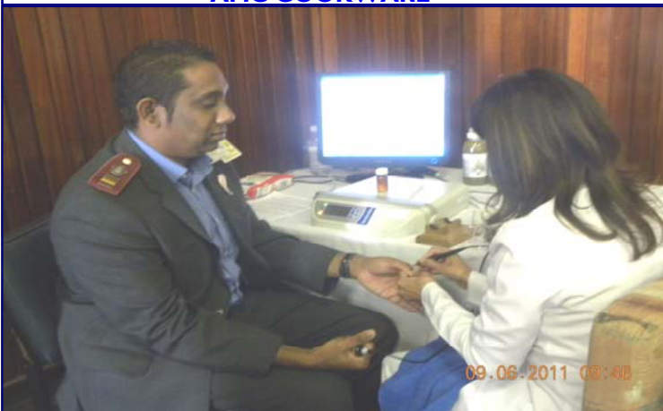
BIO MEDS DISPLAY