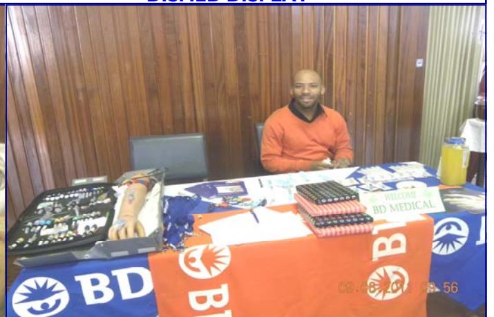
BD MEDICAL DISPLAY