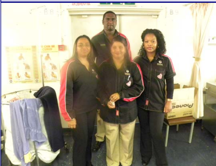
THE HIFI CORPORATION