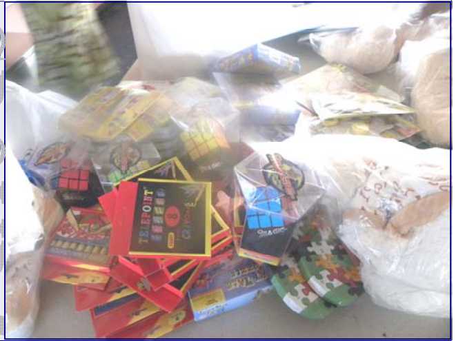
THE GROUP 5 CONSTRUCTIONS OFFERING GIFTS AND TOYS TO CHILDREN