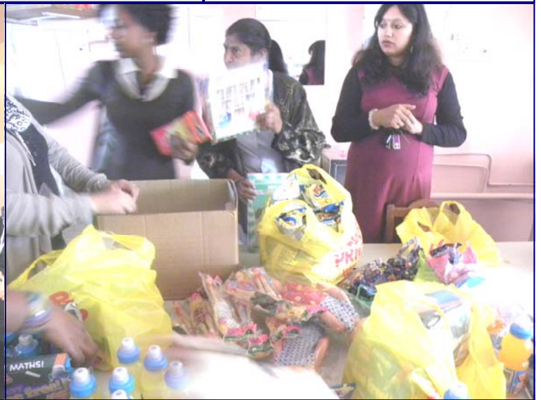
ETHEKWINI WATER AFFAIRS DEPARTMENT