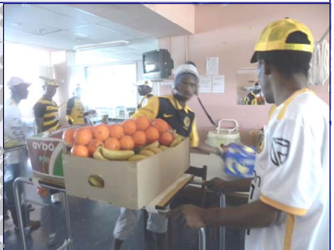
THE KAIZER CHIEFS FANS OFFERING GIFTS TO CHILDREN