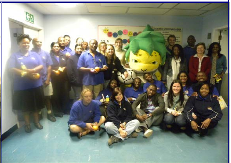
THE USHAKA MARINE SEA WORLD