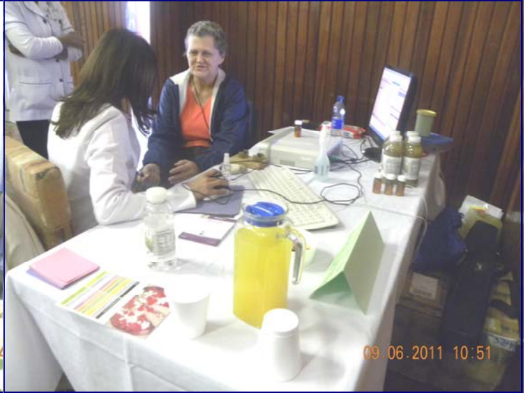
BIO MED DISPLAY