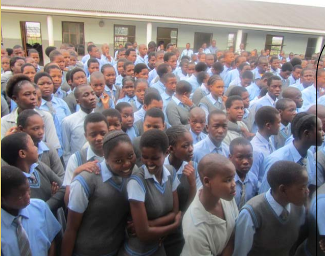
DENGE HIGH SCHOOL