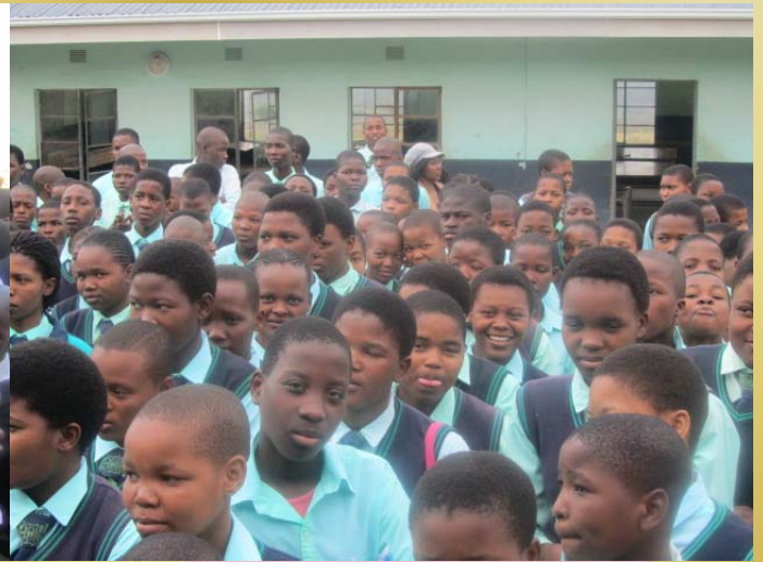
PRINCE NDABUKO HIGH SCHOOL