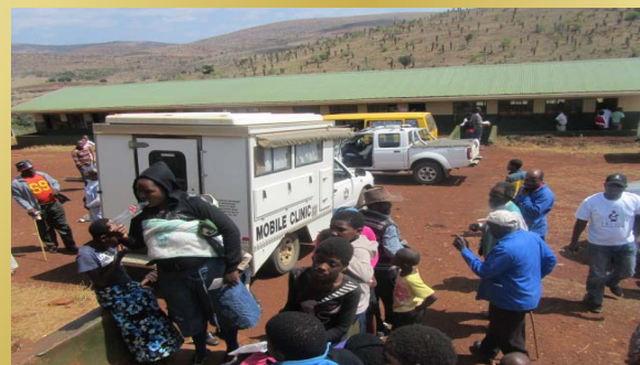
Community of Manyoni Area