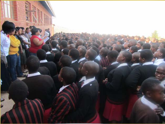
SIVANANDA HIGH SCHOOL