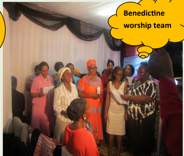
Benedictine worship team