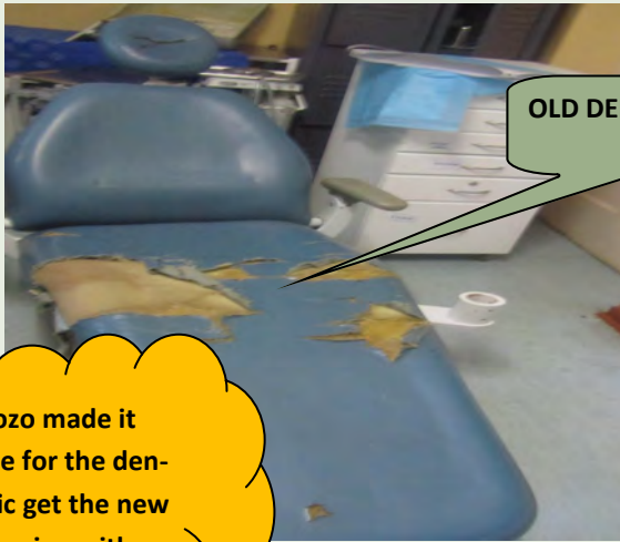
OLD DENTAL CHAIR