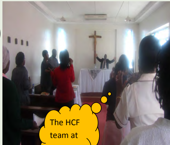
The HCF team at chapel