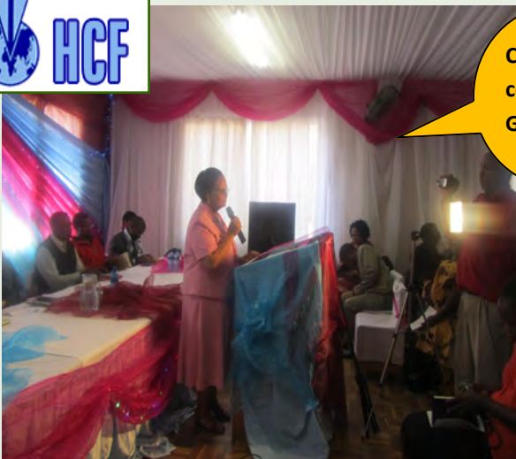
CEO welcoming Guests