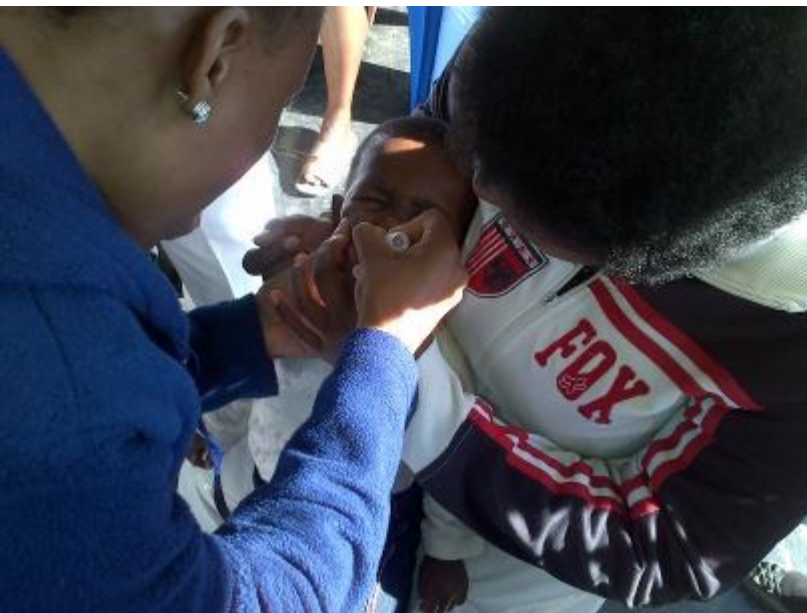
Health workers administering the Polio vaccine to a beneficiary at Bruntville CHC