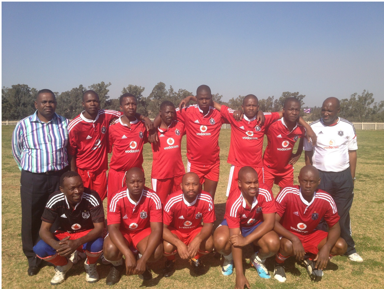
The Bruntville CHC soccer team the “Red devils”, with soccer coaches

Fighting Disease, Fighting Poverty, Giving Hope