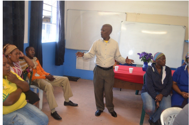
Pic 1+2 Clients being given health education to better and improve their health status.