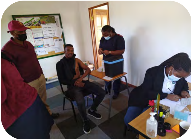
The Student of Midlands Community College with Bruntville CHC staff members

Bruntville CHC, would like to thank the outreach team and all communities involved in making this remarkable COVID-19 campaign a success. Community members are urged and encouraged to take the COVID-19 vaccine in order to protect themselves and their loved ones.