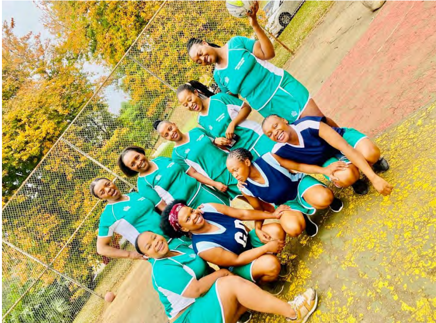
BRUNTVILLE CHC NETBALL TEAM 2022

The Kwazulu Natal department of health after lifting of Covid-19 restrictions, were involved in sport at workplace.