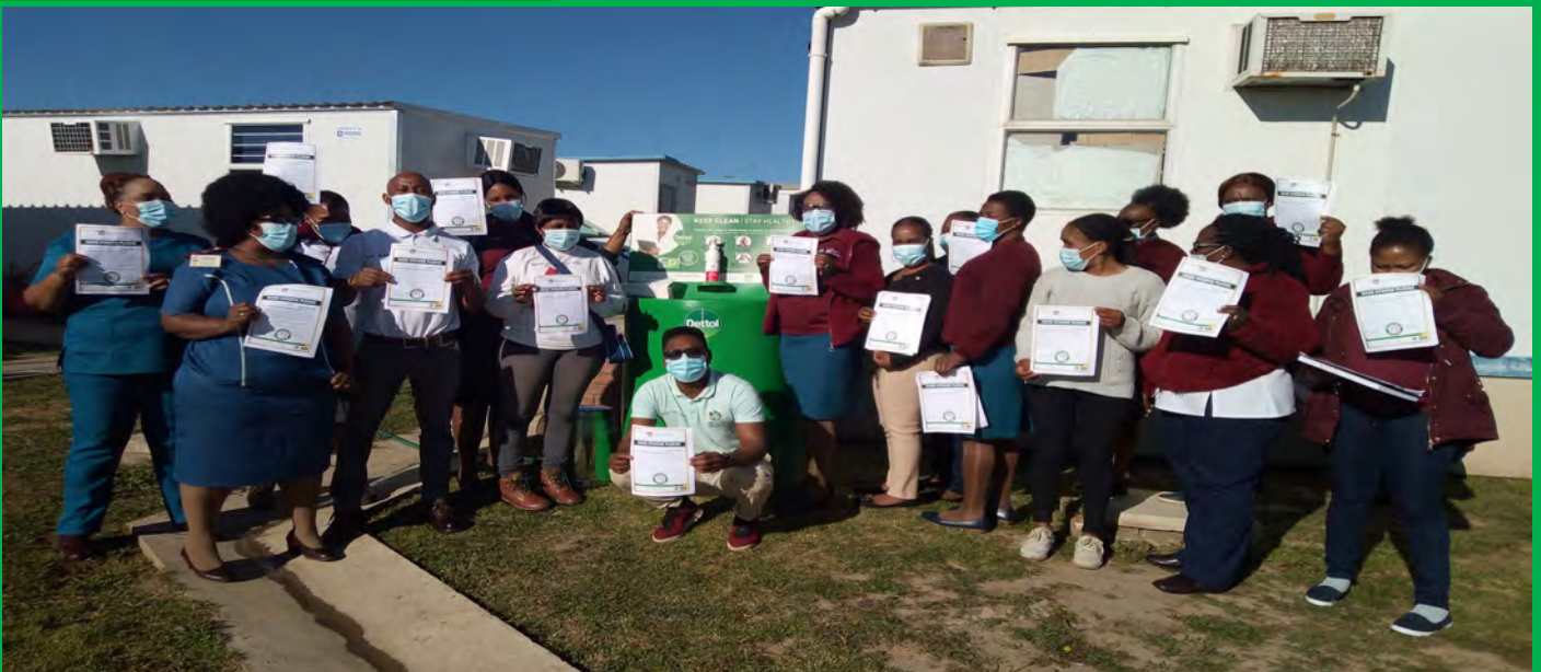
Bruntville CHC employees signed hand hygiene pledges these included the Family health team, School health team ,Outreach teams, and Covid-19 staff, Clinic Nursing Practitioners, Clinical Associates, Professional Nurses, Enrolled Nurses, Health Promoter, data capturers and cleaners. They committed themselves to comply with hand hygiene practices. In the schools and in the community hand hygiene awareness was done by whole team.