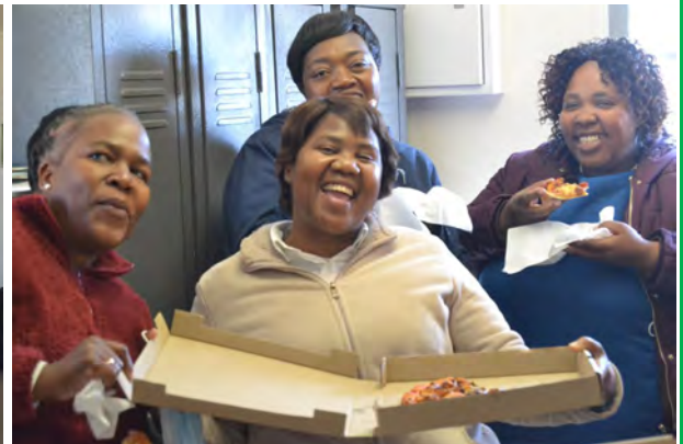
Staff members and community were given slice of pizza after 67 minutes of service