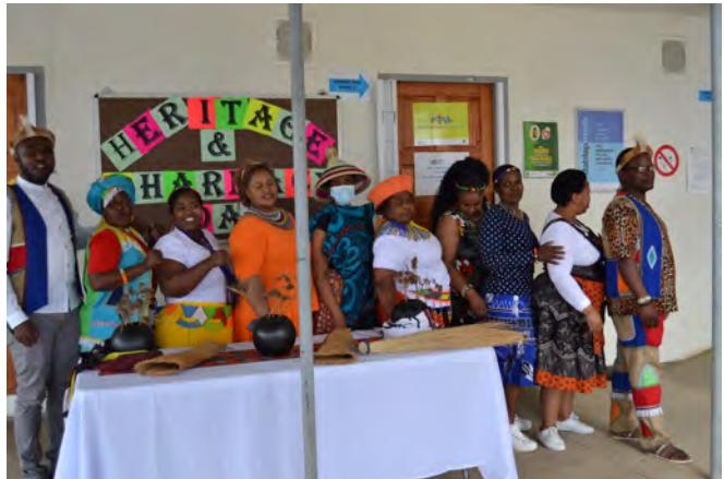
2nd best dressed group Hast component.