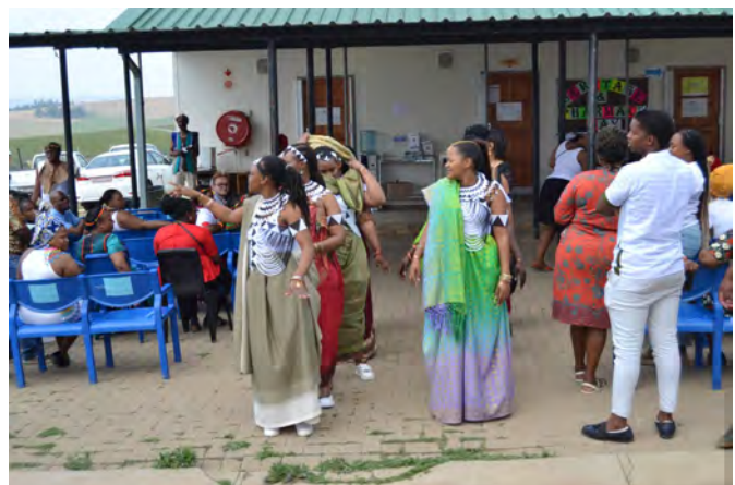
Dancing other cultures dance. Here they did not dance their own dancing culture dance. They danced other groups culture dance.