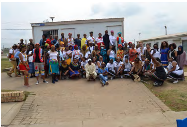
Bruntville CHC staff members and partner HST.