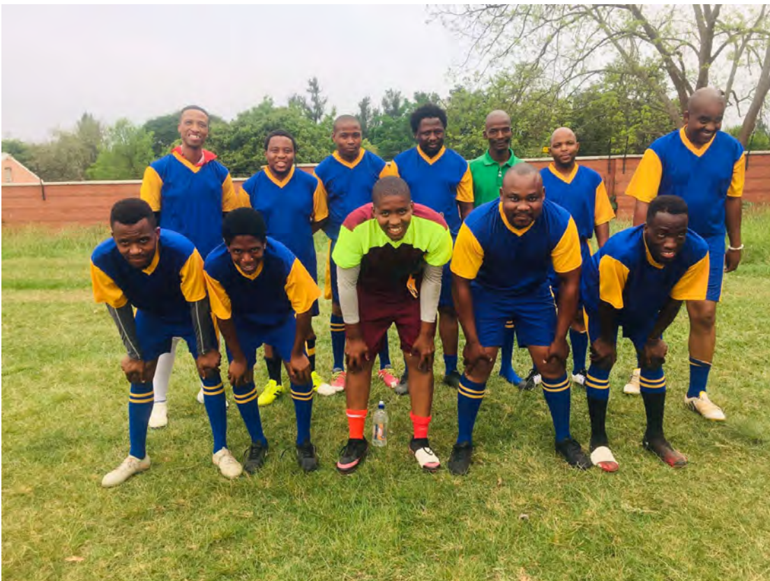
BRUNTVILLE CHC SOCCER TEAM 2022