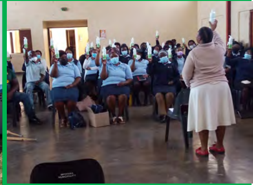
IPC coordinator emphasizing the importance of using alcohol based hand rub to Community Healthcare Workers of Mpofana Sub-District