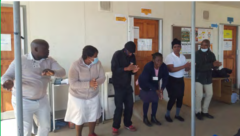
Staff members along with patients dancing to beautiful music as it was part of an exercise

The institution would like to appreciate their effort in making the 67 minutes a success, the institution thank Nsele emergency for refreshments for everyone who participated in the activities of the day. Staff members and patients did exercised on the day.