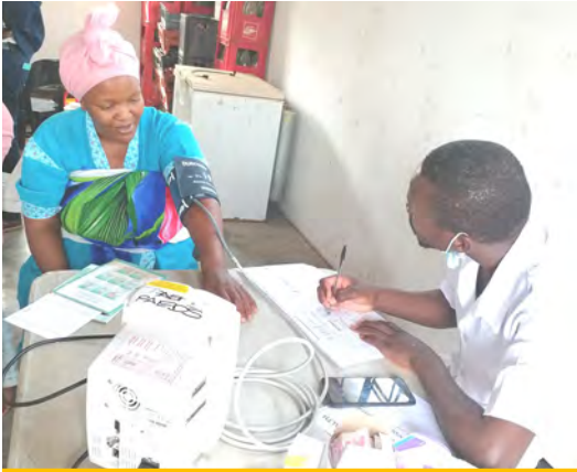
Vital Signs Station