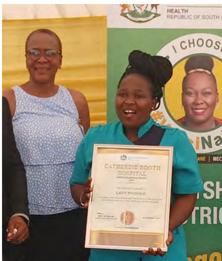
Appreciation Award for Mesisjakobe—Contracted Pot-tering Services Company