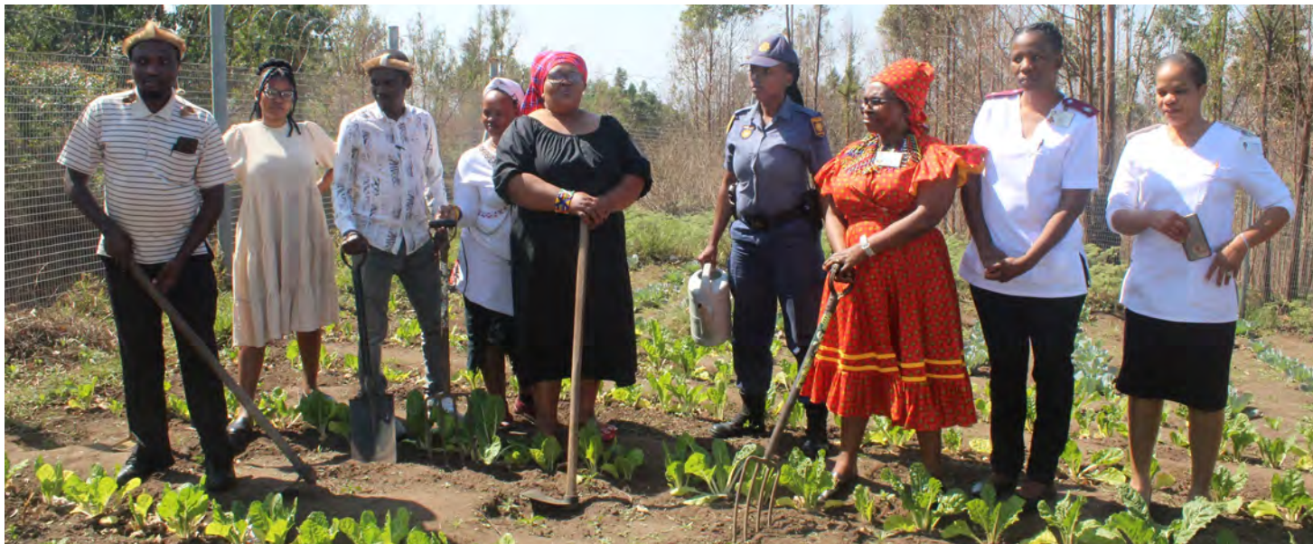
The Biyela Centre located at Mombeni under the Biyela Traditional Authority which is used for many activities in this community including healthcare services mobile point and Philamntwana centre allocated a plot for its workers to plant a garden as part of the one home ne centre, one garden initiative.

Living a healthy lifestyle which includes eating a healthy balanced diet, drinking water more frequently and exercising. These were some of the topics that speakers spoke about during the Biyela Centre Women's Day celebration which was held on the 21st September 2023 at Biyela Centre.