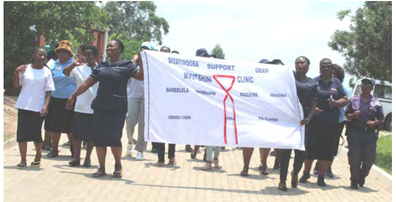
The event started by a community march which followed by a lighting of candles at the venue.