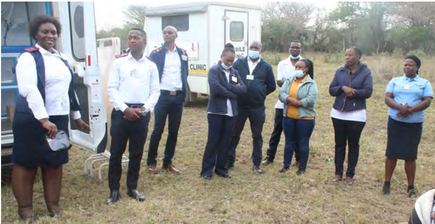
Mobile team was being introduced to the community of Mankengani