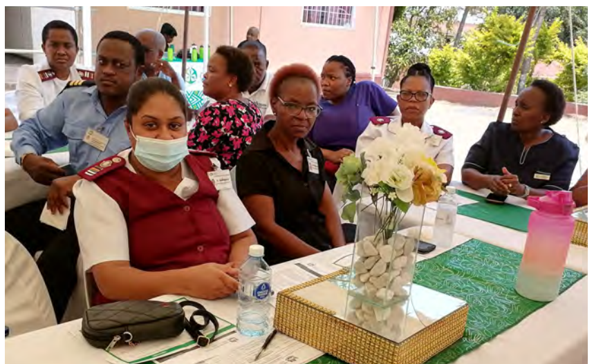
CBH staff members during the Service Excellent Awards 2023