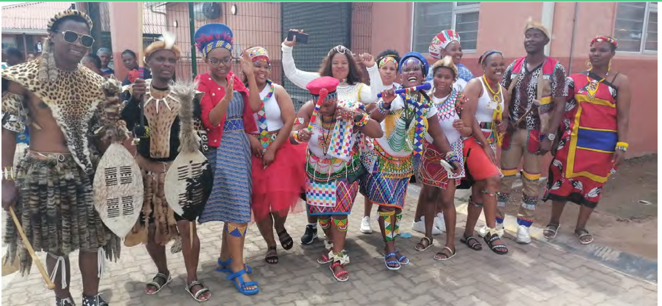
Catherine Booth Hospital staff gathered in the facility's dining hall to celebrate heritage day.