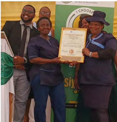
Appreciation Award for the contracted cleaning service company—Zoma M. Projects